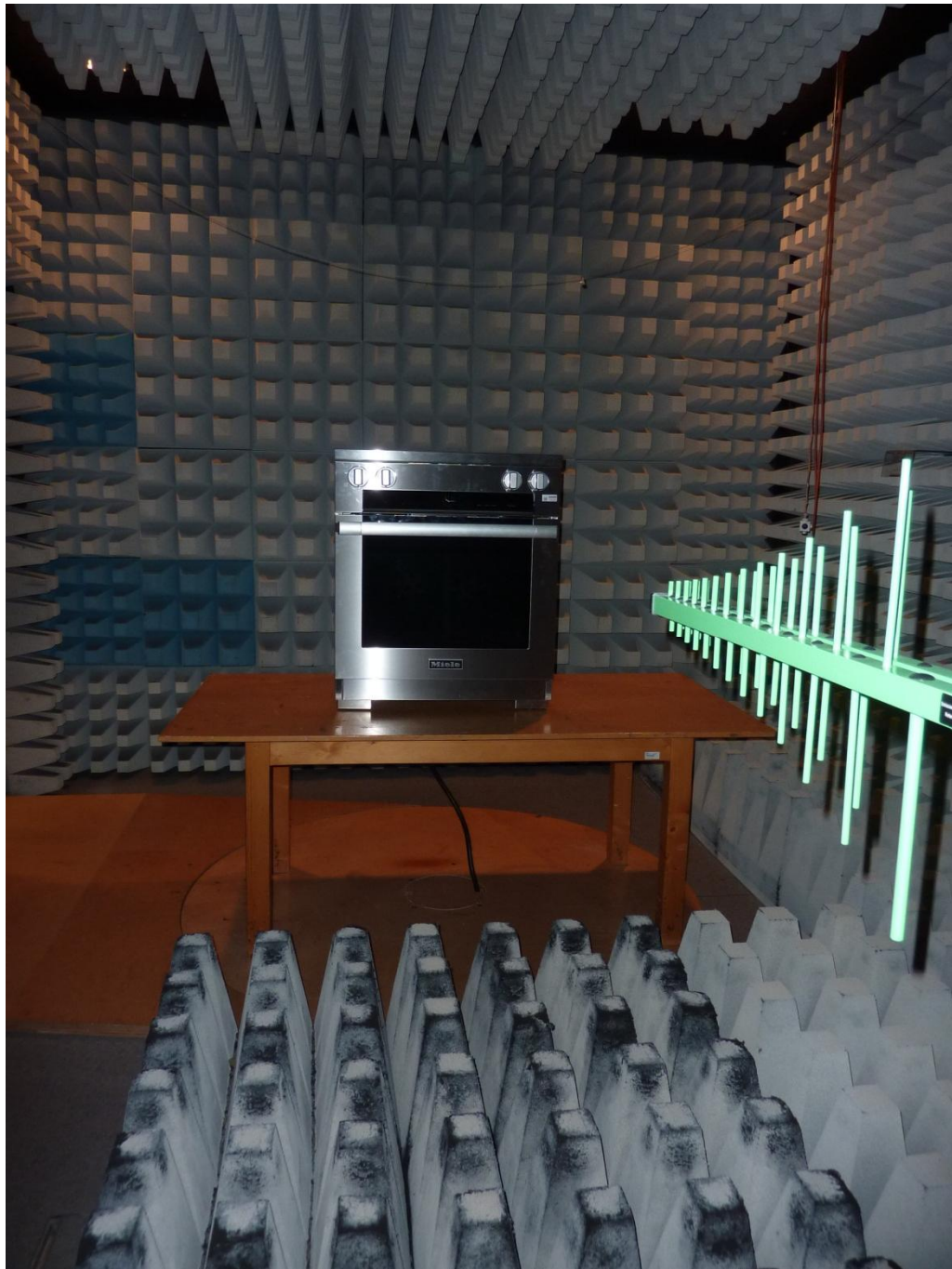
136015_1_2.JPG: EPI7674 inside HR1622, test set-up fully anechoic chamber