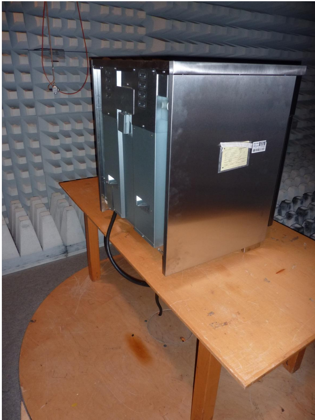
136015_1_3.JPG: EPI7674 inside HR1622, test set-up fully anechoic chamber