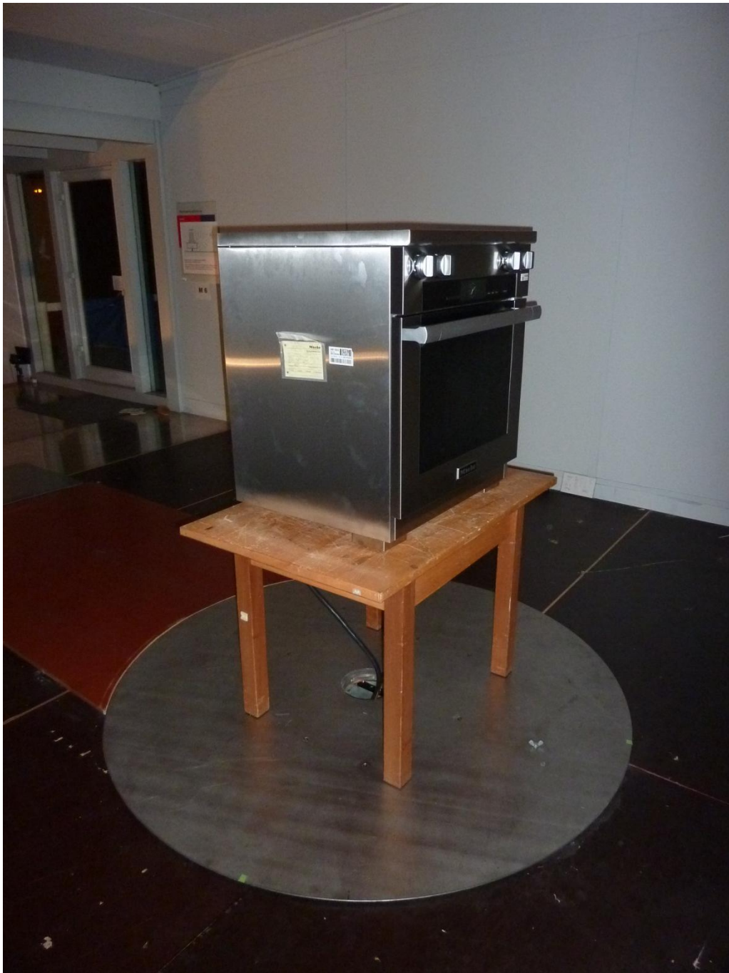
136015_1_5.JPG: EPI7674 inside HR1622, test set-up open area test site