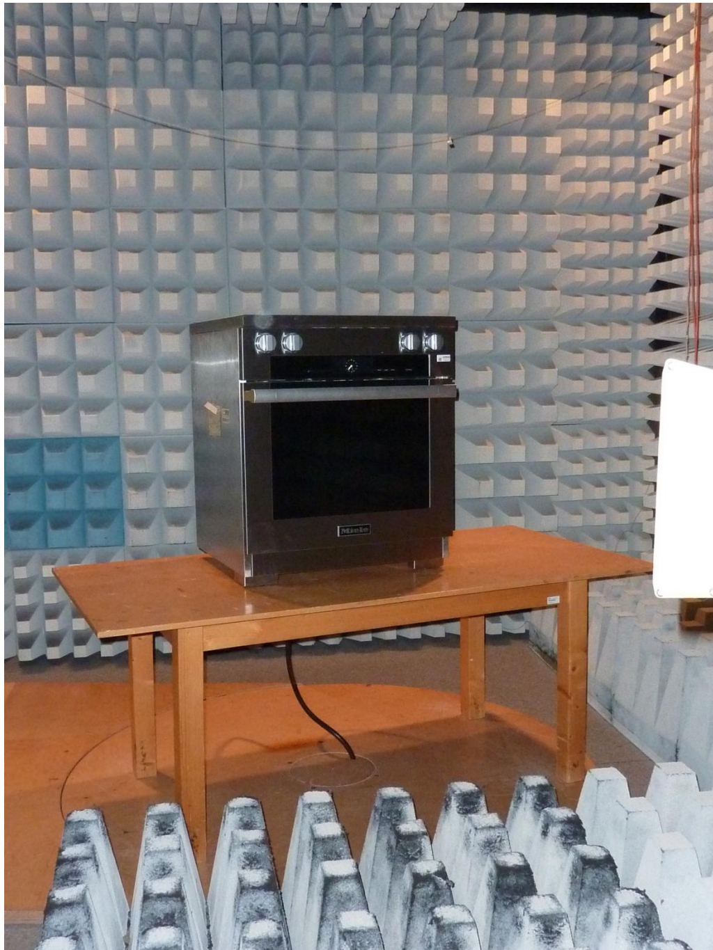
136015_1_1.JPG: EPI7674 inside HR1622, test set-up fully anechoic chamber