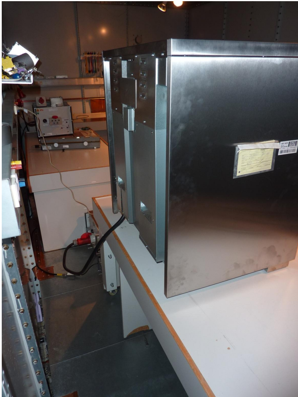
136015_1_7.JPG: EPI7674 inside HR1622, test set-up shielded chamber