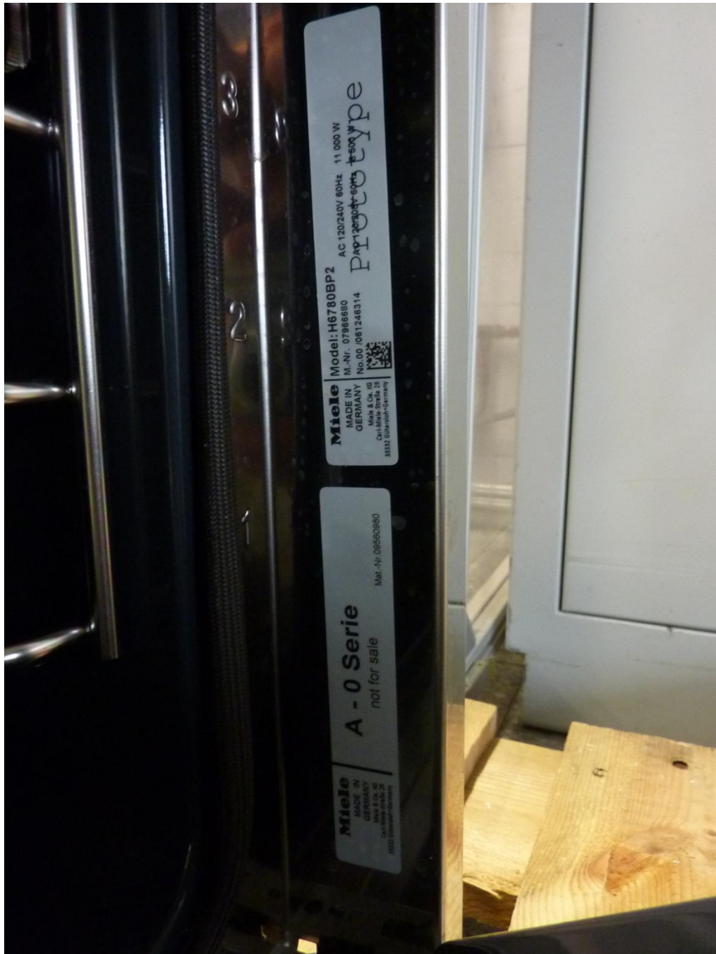
132604_3_h.JPG: H6780BP2, type plate