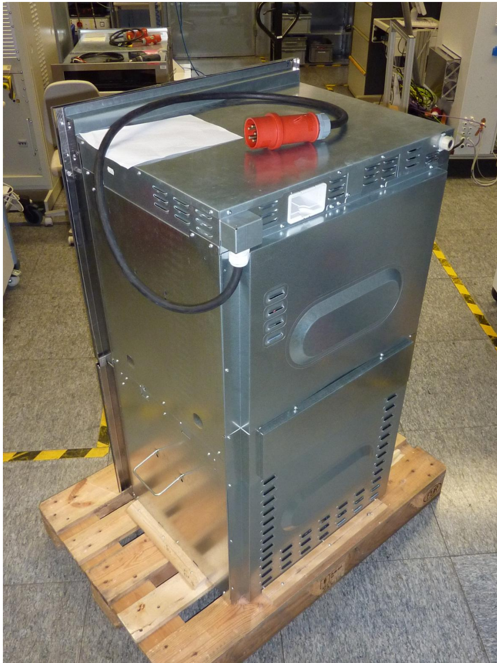
132604_3_b.JPG: H6780BP2, 3-D.view 2