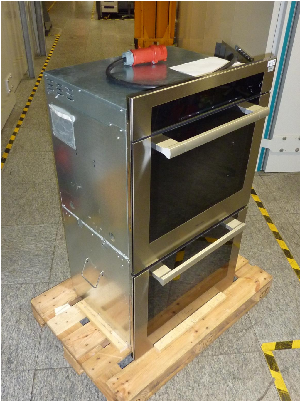
132604_3_a.JPG: H6780BP2, 3-D-view 1