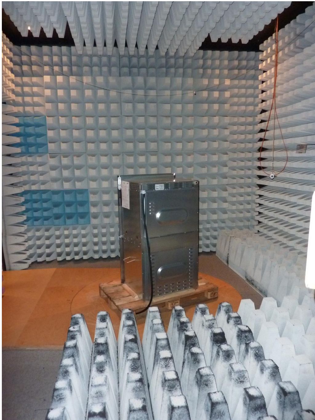
132604_3_3.JPG: EPI7674 inside H6780BP2, test set-up fully anechoic chamber