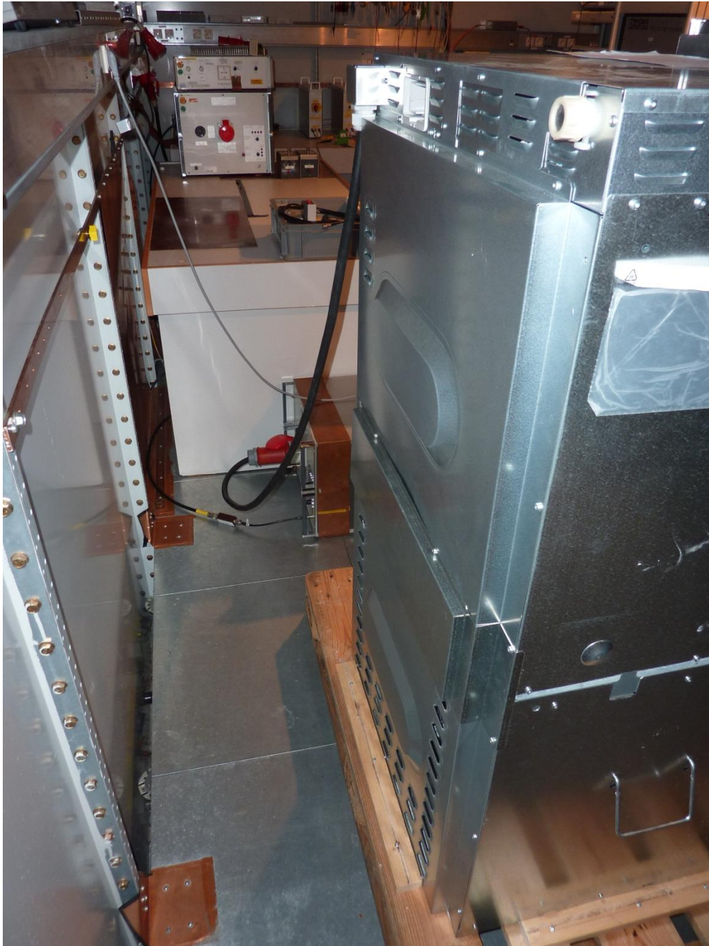
132604_3_6.JPG: EPI7674 inside H6780BP2, test set-up shielded chamber