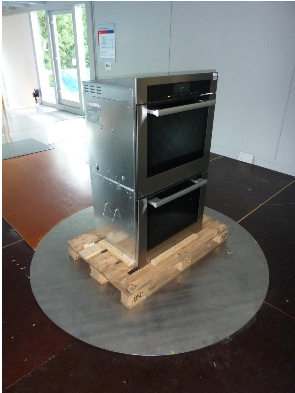
132604_3_5.JPG: EPI7674 inside H6780BP2, test set-up open area test site