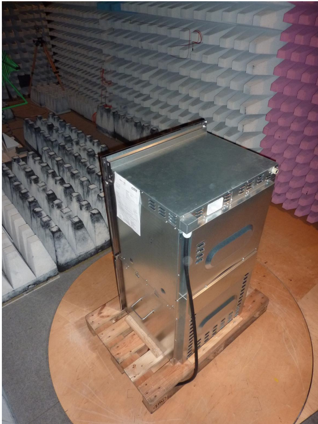
132604_3_2.JPG: EPI7674 inside H6780BP2, test set-up fully anechoic chamber