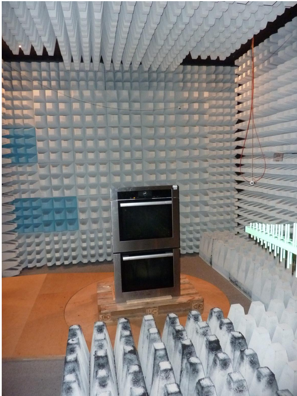
132604_3_1.JPG: EPI7674 inside H6780BP2, test set-up fully anechoic chamber