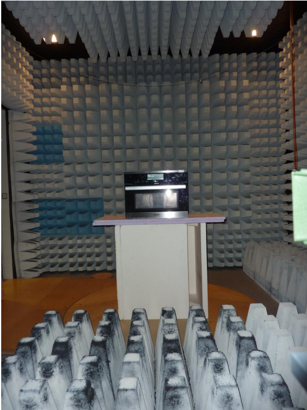
144218_g.JPG: H6700BM, test set-up fully anechoic chamber