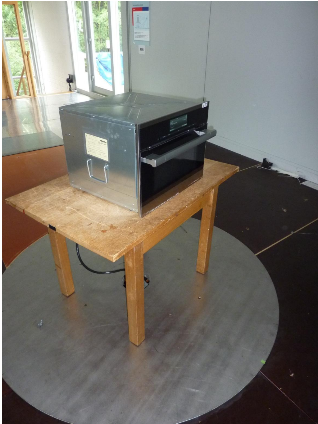
144218_b.JPG: H6700BM, test set-up open area test site