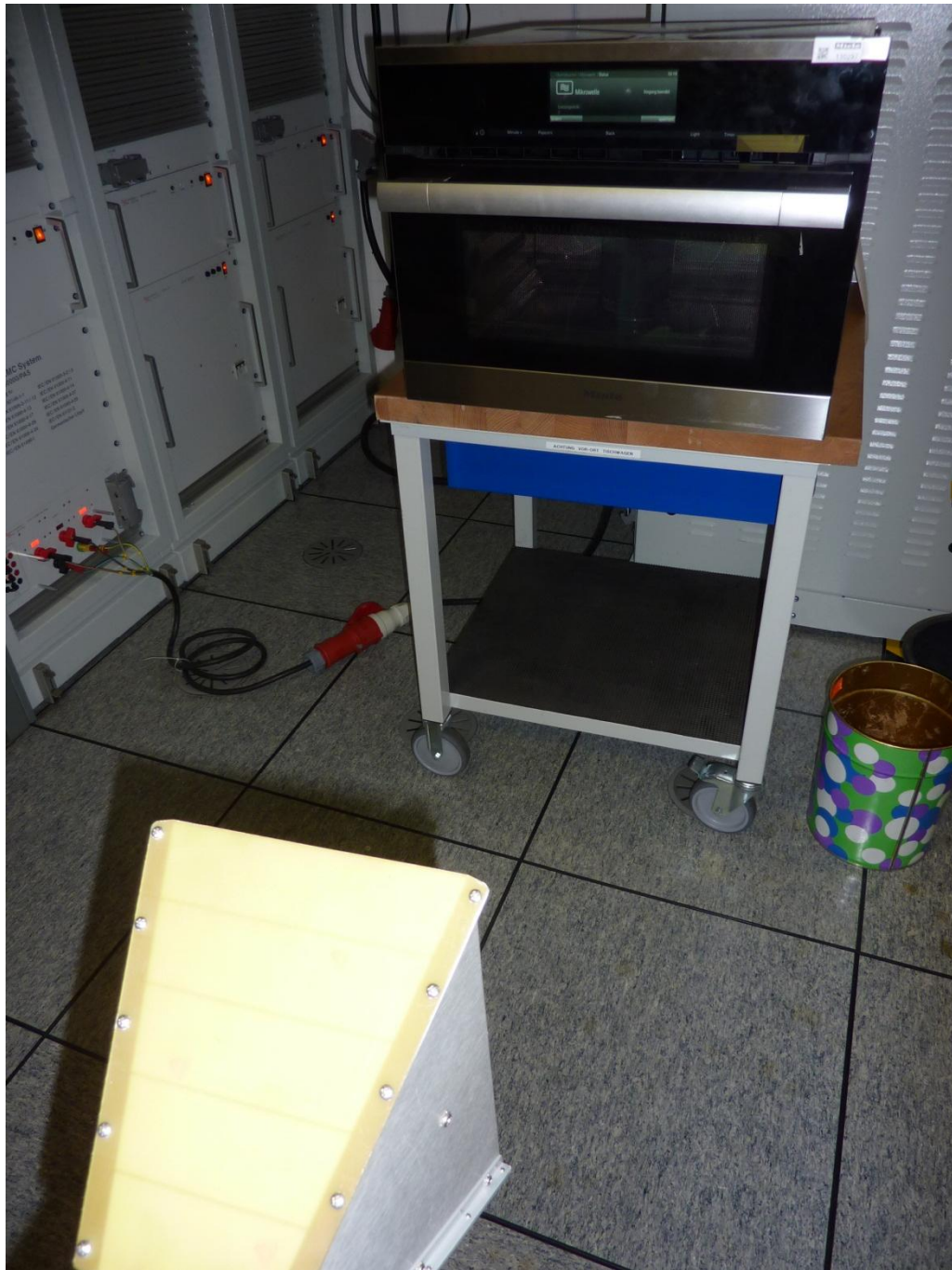
144218_d.JPG: H6700BM, test set-up frequency range measurement