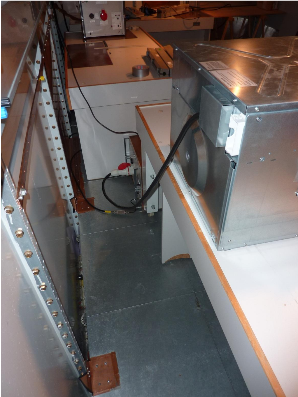
144218_a.JPG: H6700BM, test set-up shielded chamber