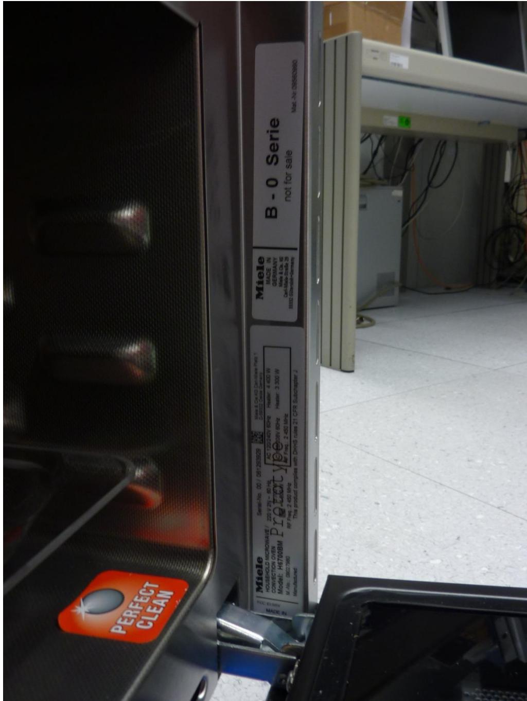
144218_4.JPG: H6700BM, type plate view