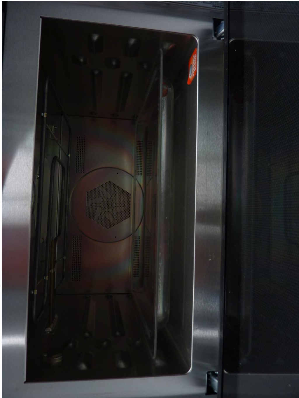
144218_7.JPG: H6700BM, cooking chamber (door opened)