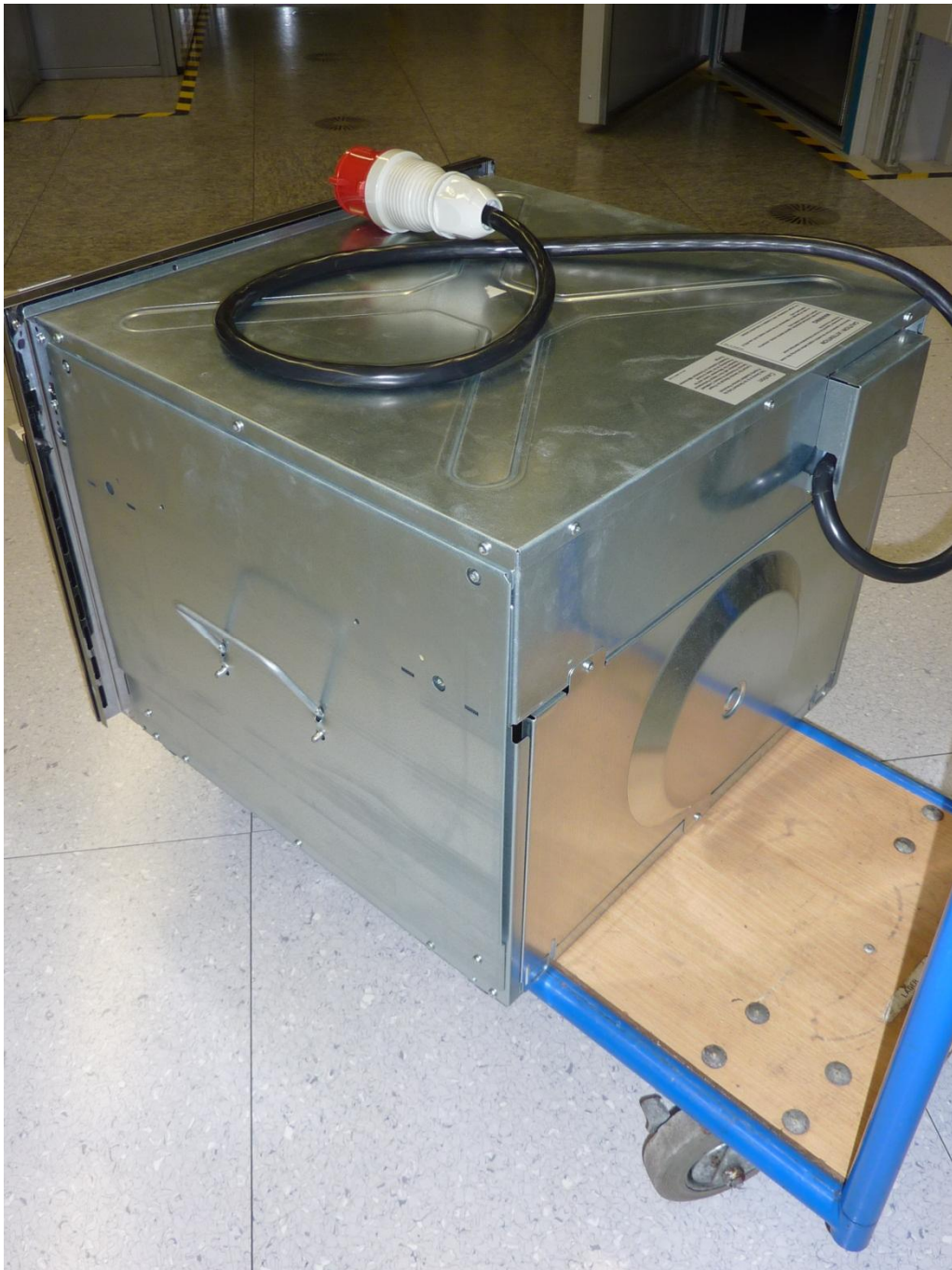
144218_2.JPG: H6700BM, 3-D-view 2