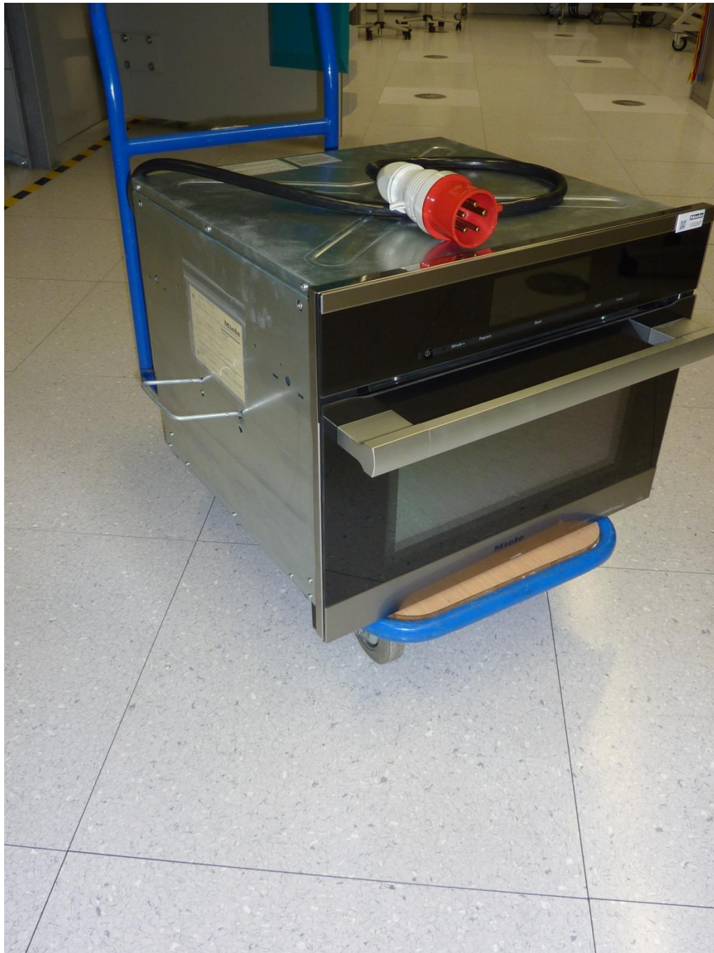
144218_1.JPG: H6700BM, 3-D-view 1