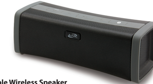
Portable Wireless Speaker User's Guide for Model No. ISB295 v1238-01