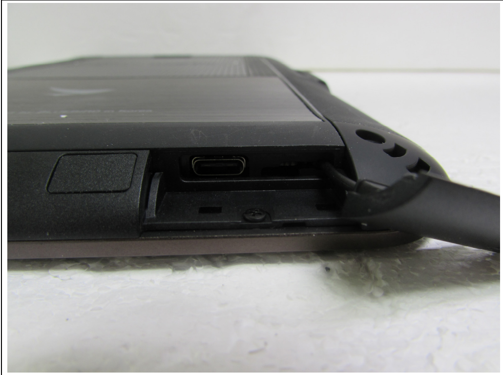
< C type port >