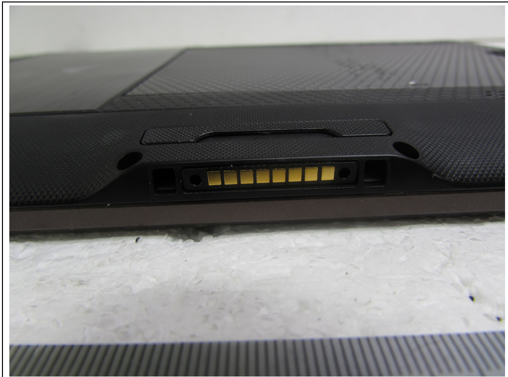
<Connect port >