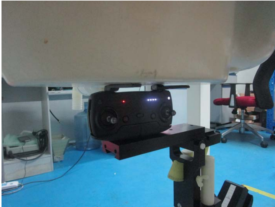
Test Position_Top (0mm)