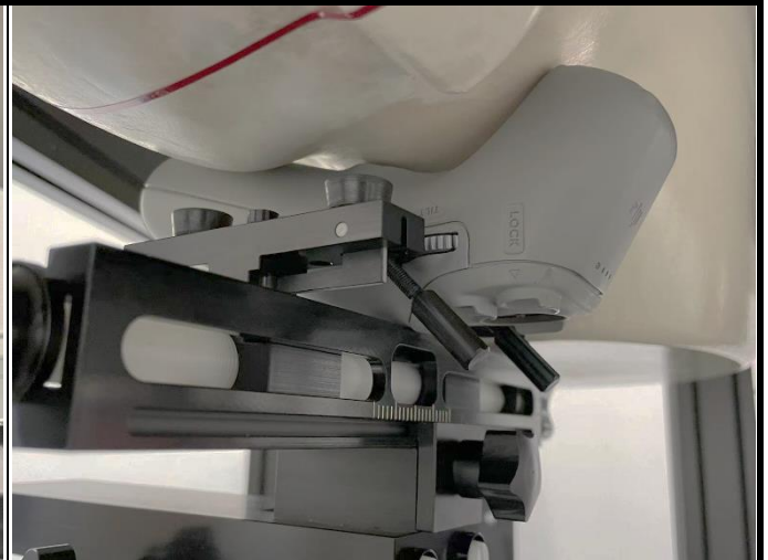
Inside of EUT with 0 cm Gap