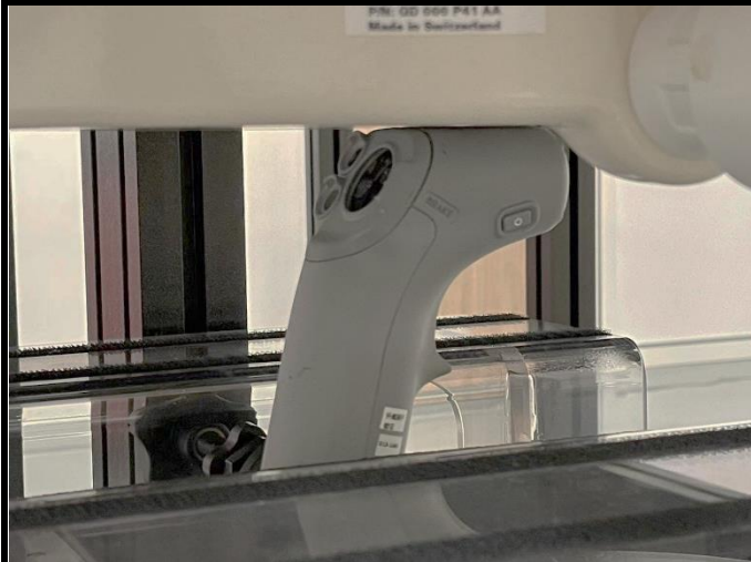
Front Side of EUT with 0 cm Gap