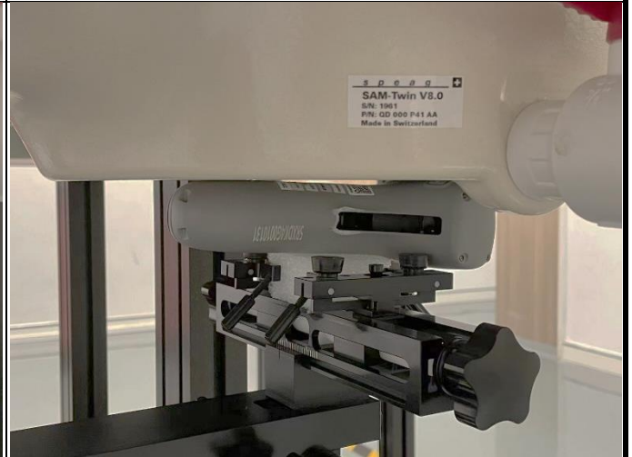
Right Side of EUT with 0 cm Gap