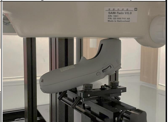
Bottom Side of EUT with 0 cm Gap