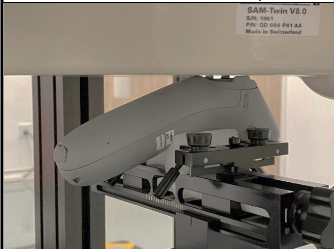
Top Side of EUT with 0 cm Gap