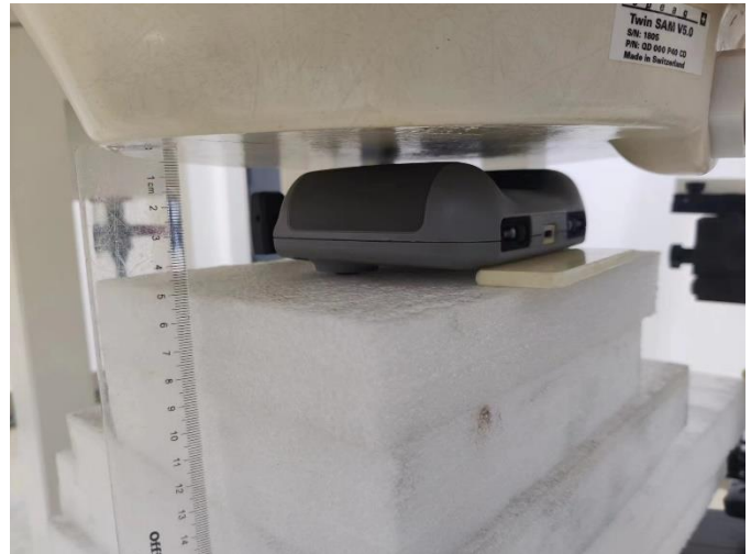
Body-Back Surface (5 mm)