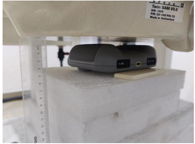
Body-Back Surface (5 mm)