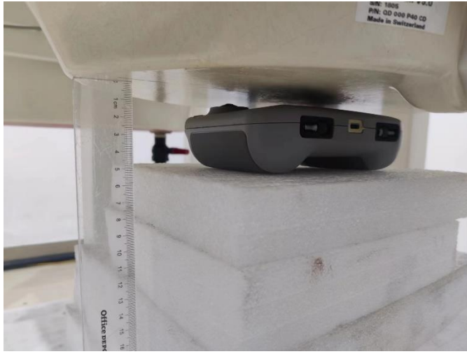
Body-Front Surface (5 mm)