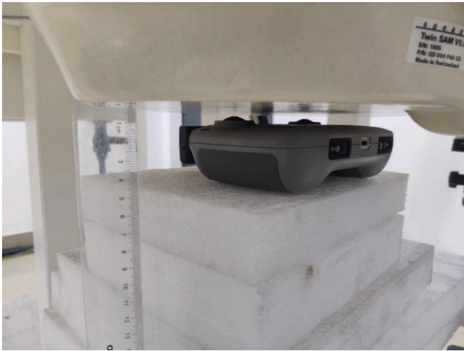
Body-Front Surface (5 mm)