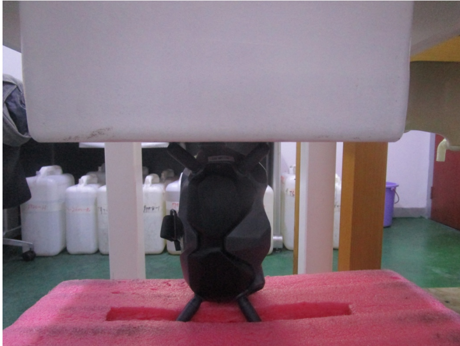
Test Position_Top Side