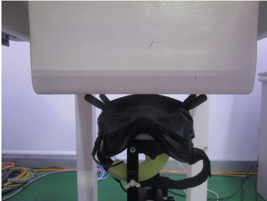
Test Position_Left Side