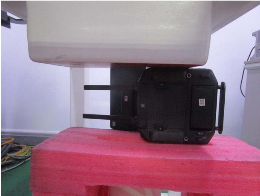
Test Position_Right (0mm)