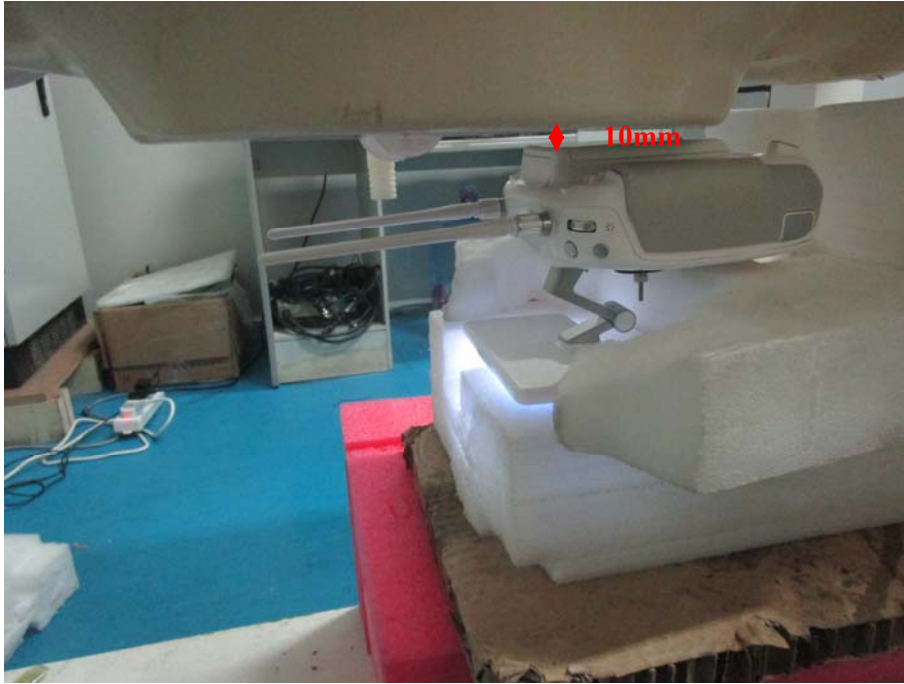
Test Position_Back Antenna Fold (10mm)