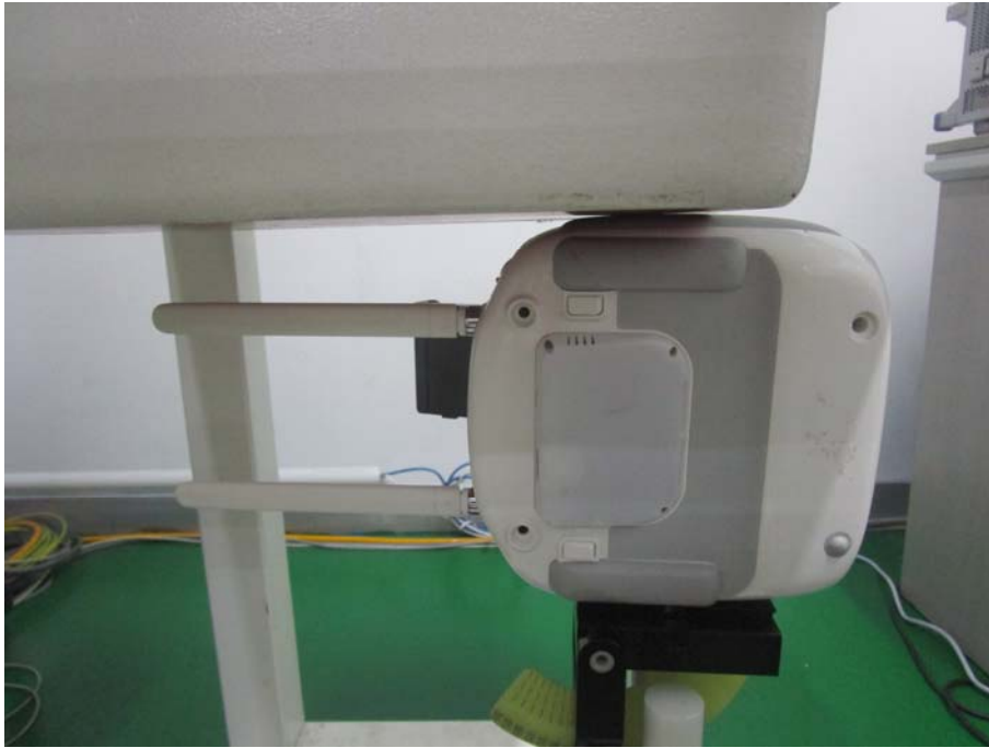
Test Position_Right (0mm)