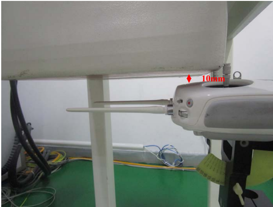
Test Position_Top (10mm)