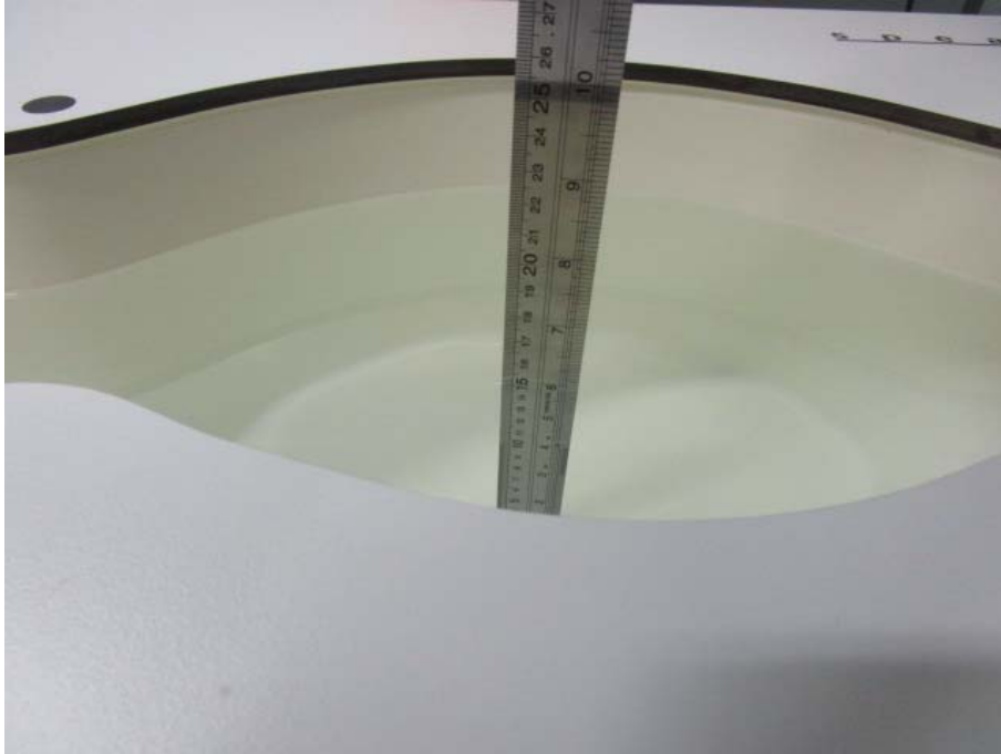
Left Head Setup Photo