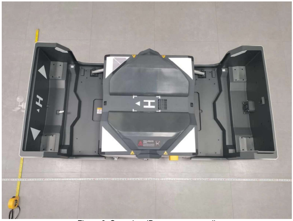
Figure 6. Over view (Door cover opened)