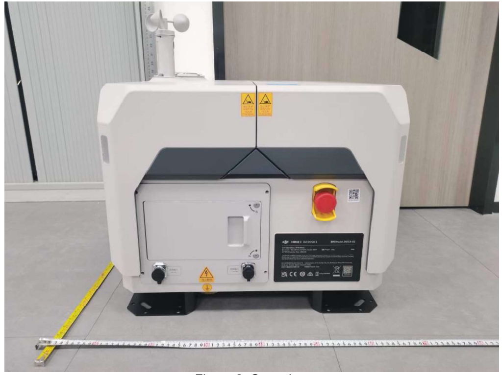
Figure 2. Over view