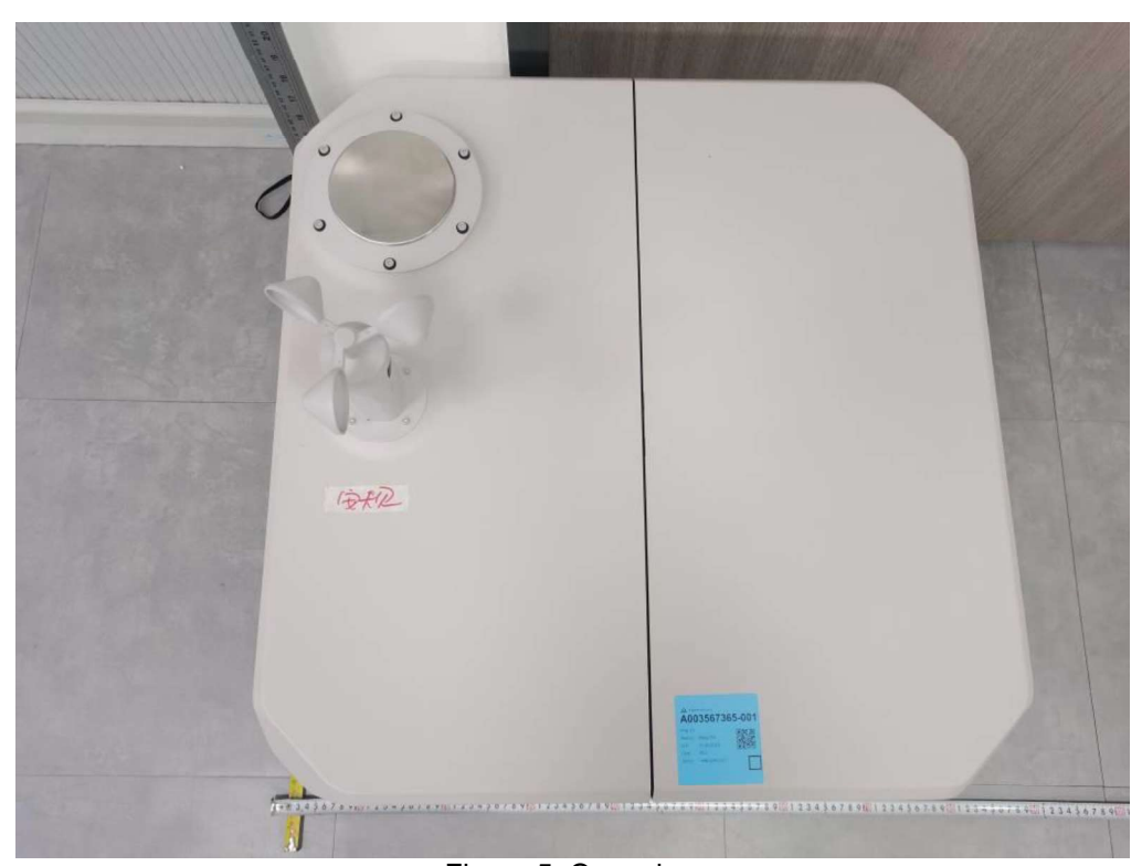
Figure 5. Over view

Product: DJI DOCK 2 Type Designation: DOCK-02