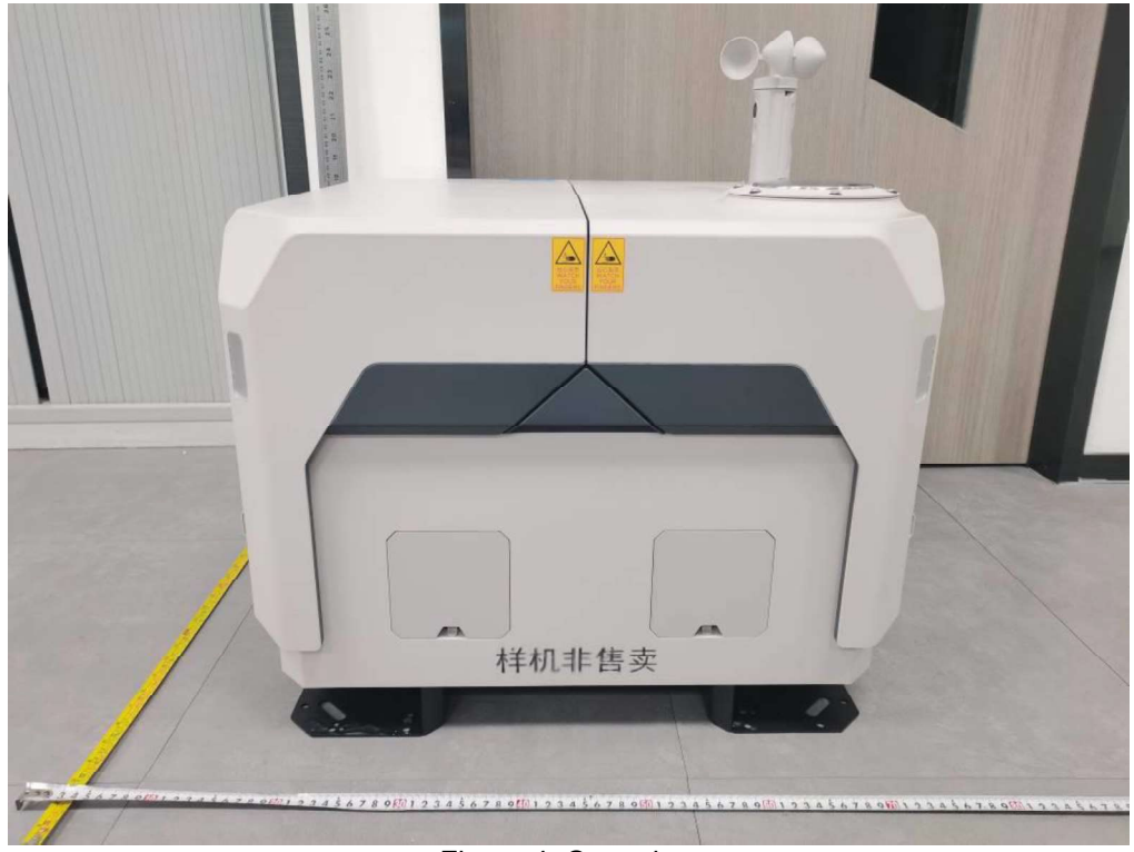
Figure 4. Over view