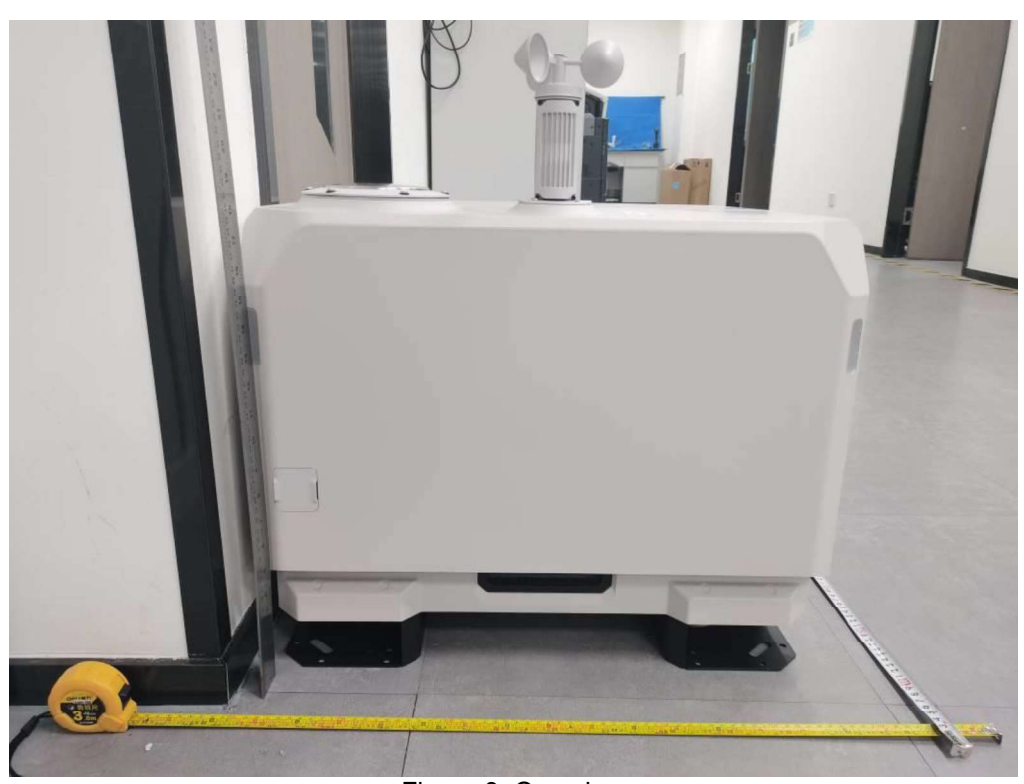
Figure 3. Overview

Product: DJI DOCK 2 Type Designation: DOCK-02