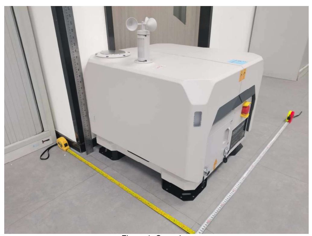
Figure 1. Over view

Product: DJI DOCK 2 Type Designation: DOCK-02