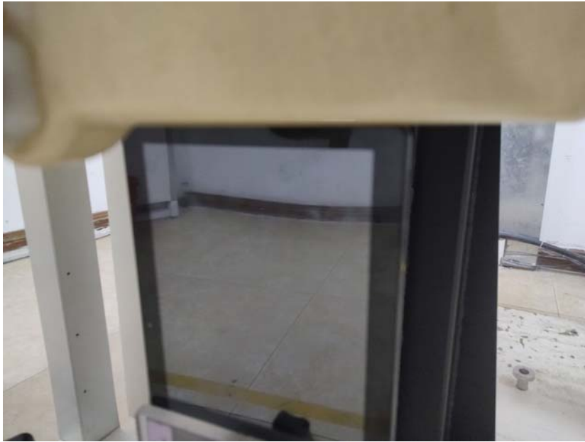
Edge 2 (Test distance: 0mm)