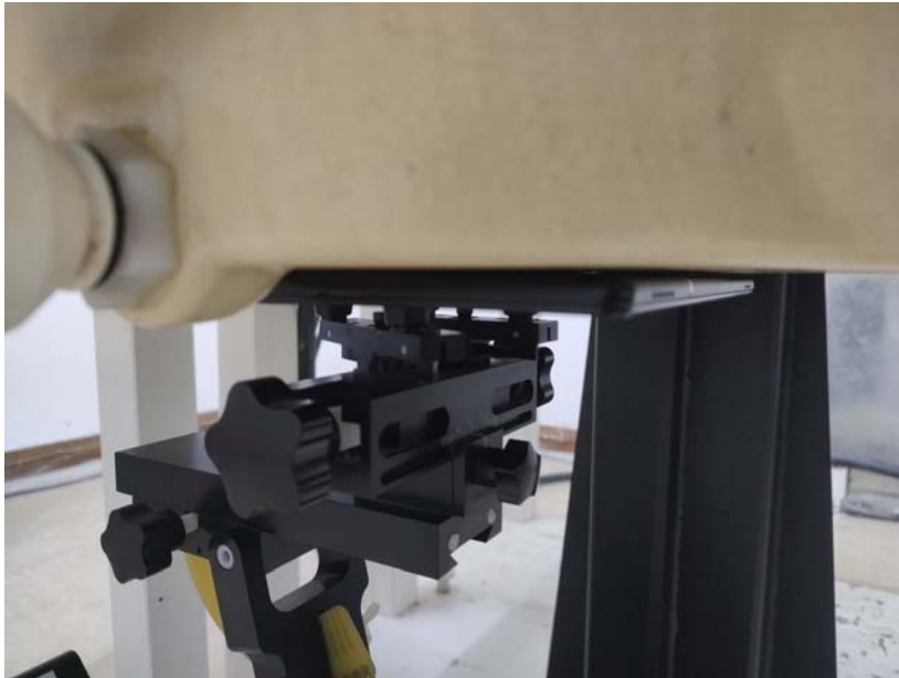
Bottom Face (Test distance: 0mm)