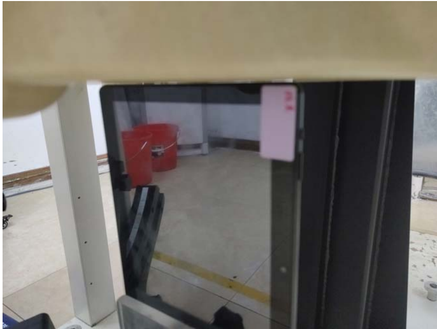
Edge 4 (Test distance: 0mm)