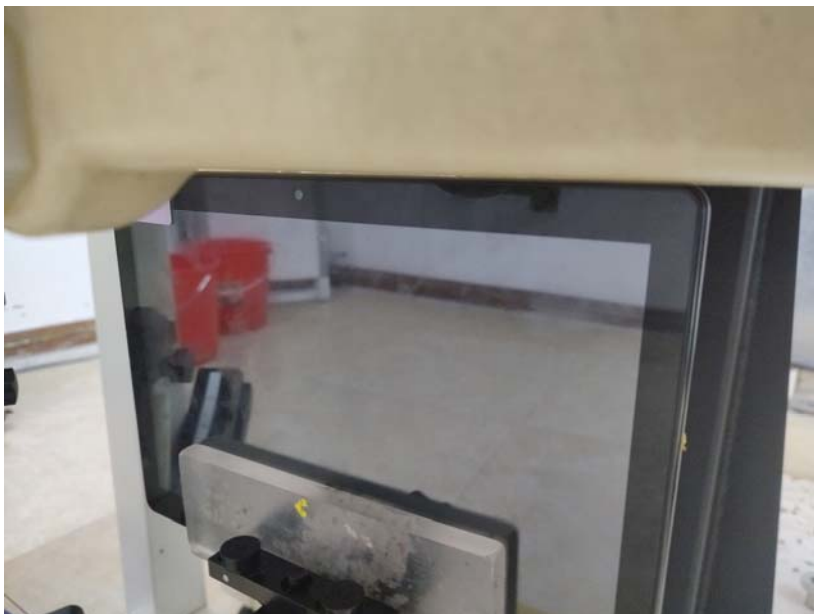
Edge 1 (Test distance: 0mm)