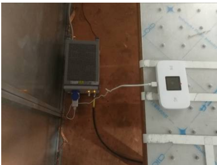
Conducted Emissions Test Setup (with charger)