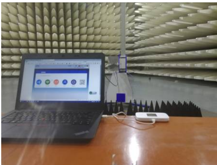
Radiated Emissions Test Setup (with laptop) (above 1GHz)