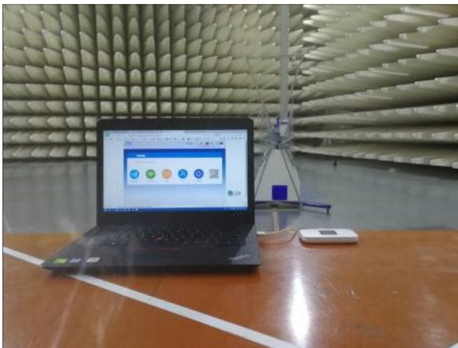
Radiated Emissions Test Setup (with laptop) (30-1000MHz)