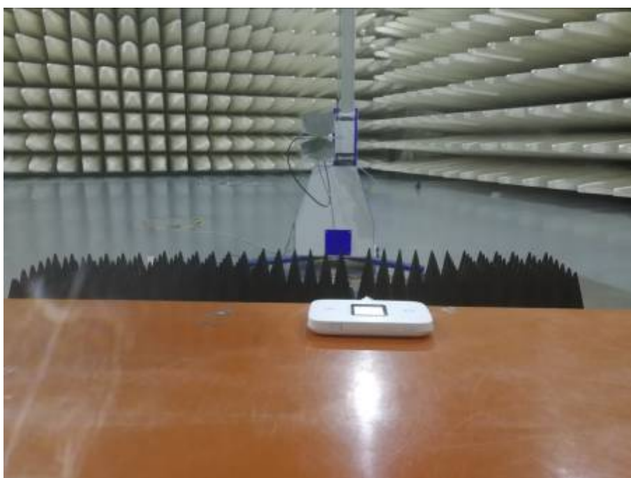
Radiated Emissions Test Setup (with charger) (above 1GHz)