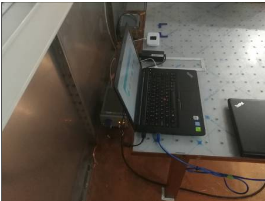
Conducted Emissions Test Setup (with laptop)