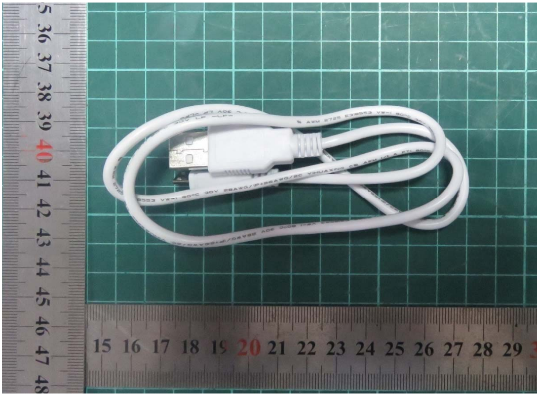
d: USB Cable