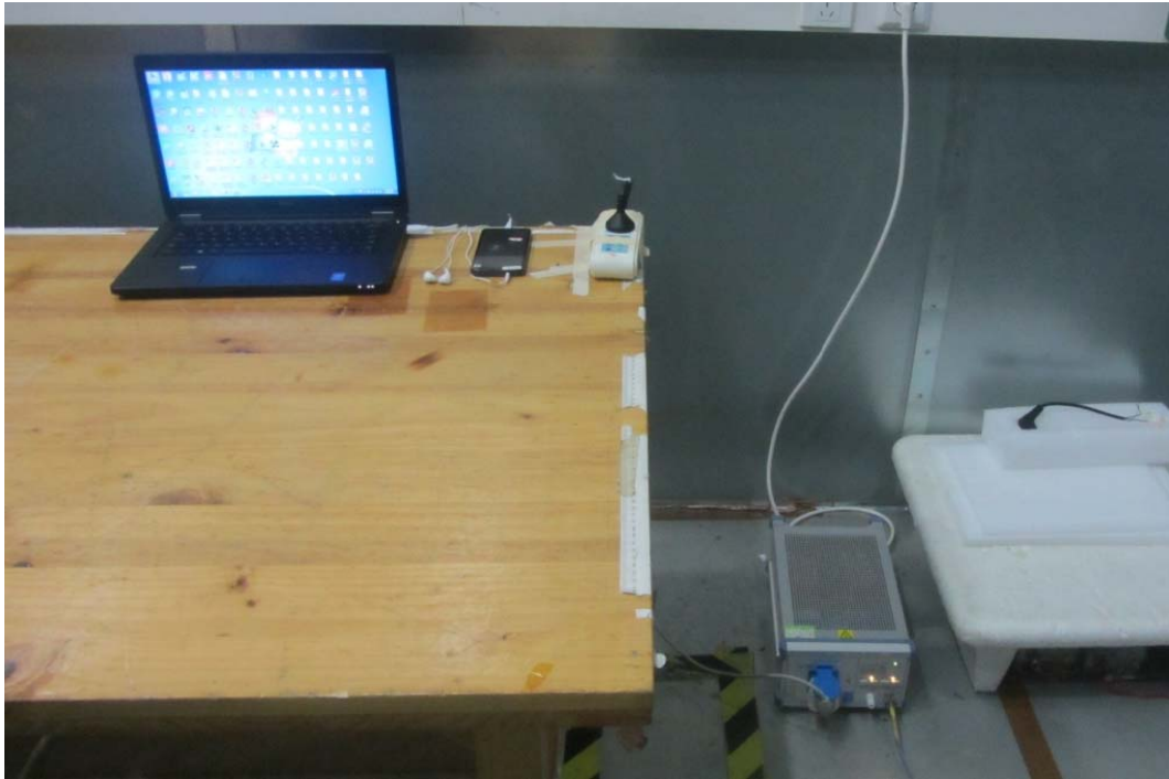
Picture 2 Conducted Emission Test Setup