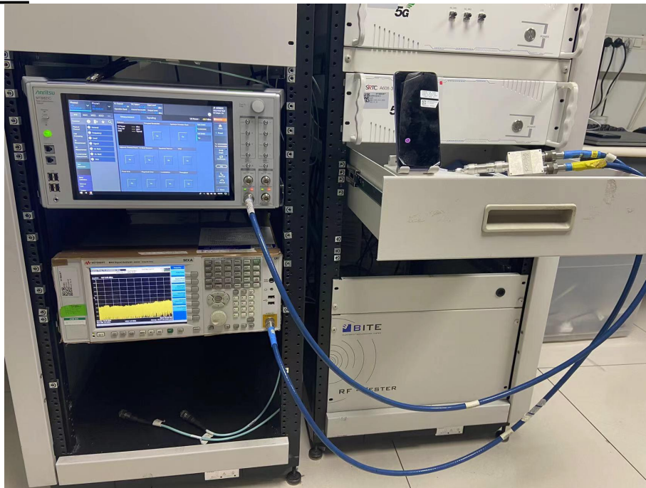
RF Conducted Test setup (GSM/WCDMA/LTE)