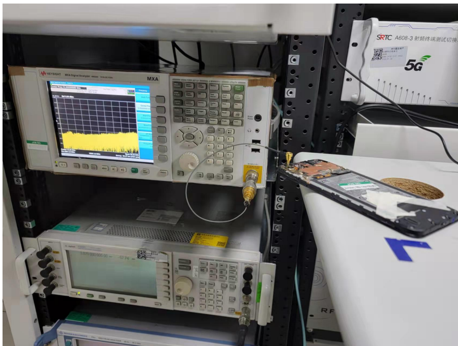
RF Conducted Test setup (BT/WIFI)