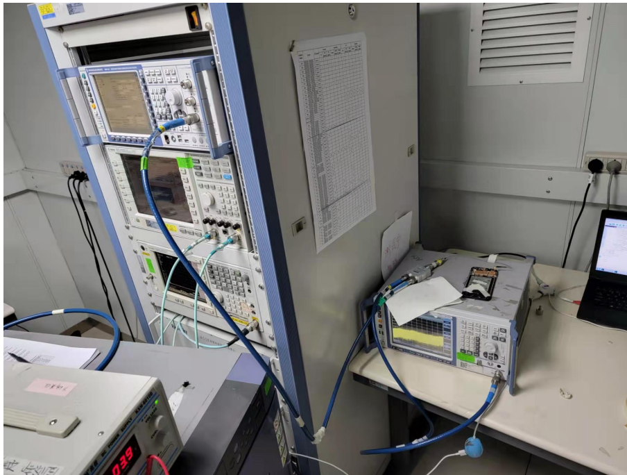
RF Conducted Test setup (GSM/WCDMA/LTE)