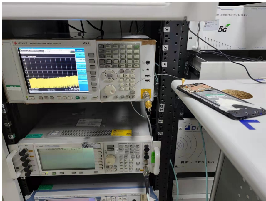
RF Conducted Test setup (BT/WIFI)