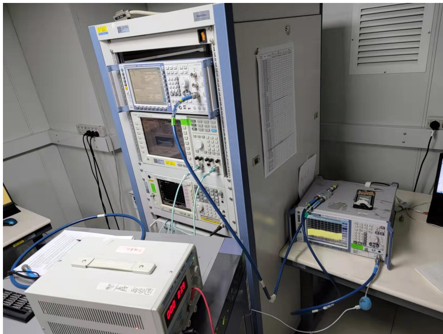
RF Conducted Test setup (GSM/WCDMA/LTE)