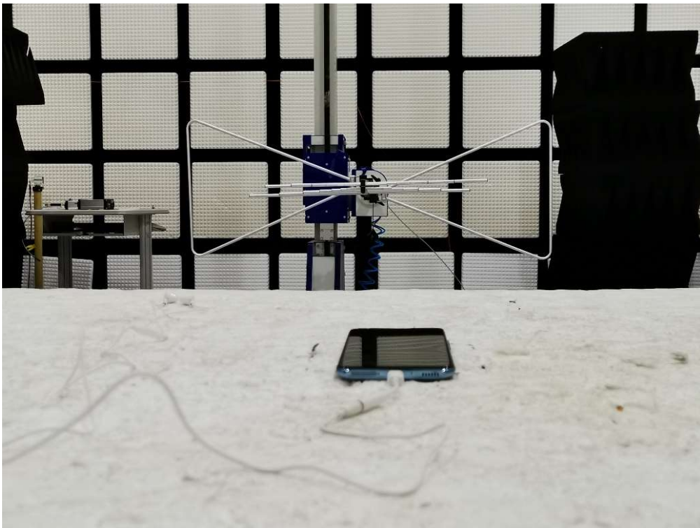
Field Strength of Spurious Radiation (30MHz - 1GHz)