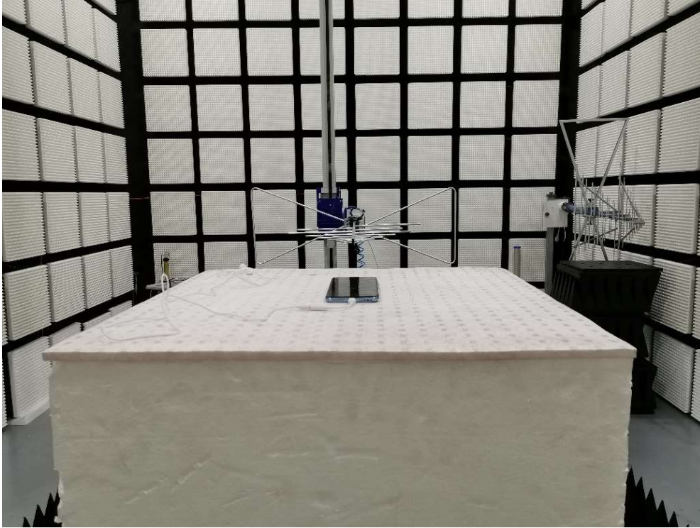
Field Strength of Spurious Radiation (1GHz - 3GHz)