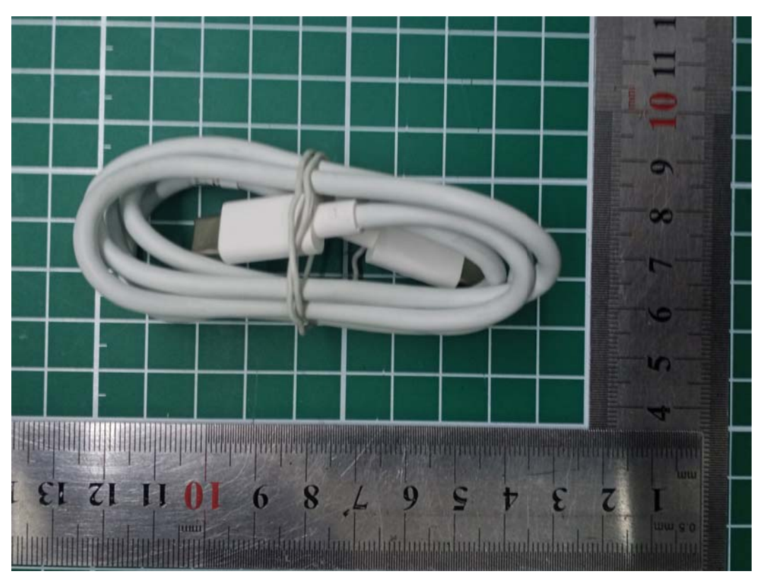
d: USB Cable