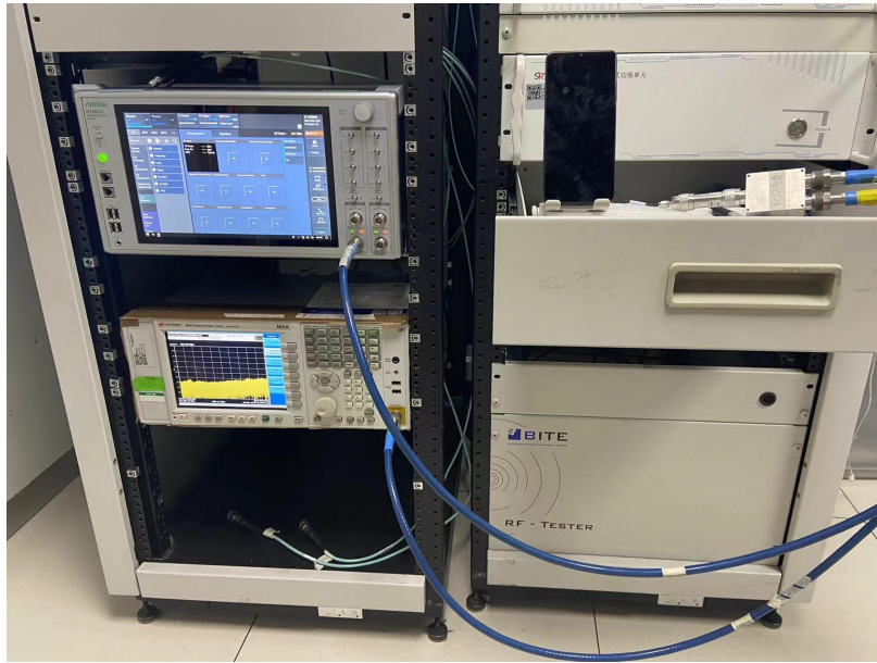
RF Conducted Test setup (GSM/WCDMA/LTE)