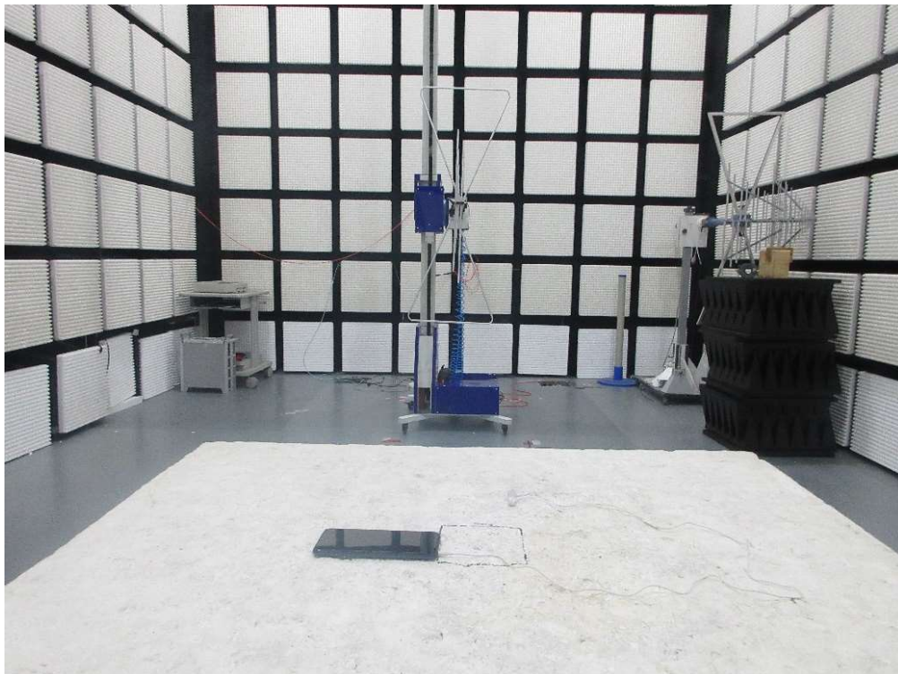
Field Strength of Spurious Radiation (30MHz - 1GHz)