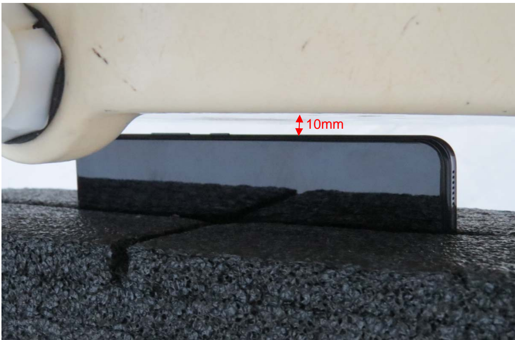
Picture 10: Right Side, the distance from handset to the bottom of the Phantom is 10mm