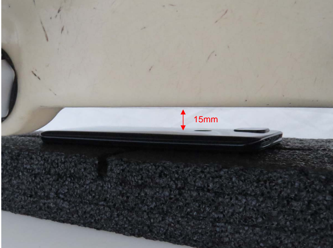
Picture 5: Back Side, the distance from handset to the bottom of the Phantom is 15mm