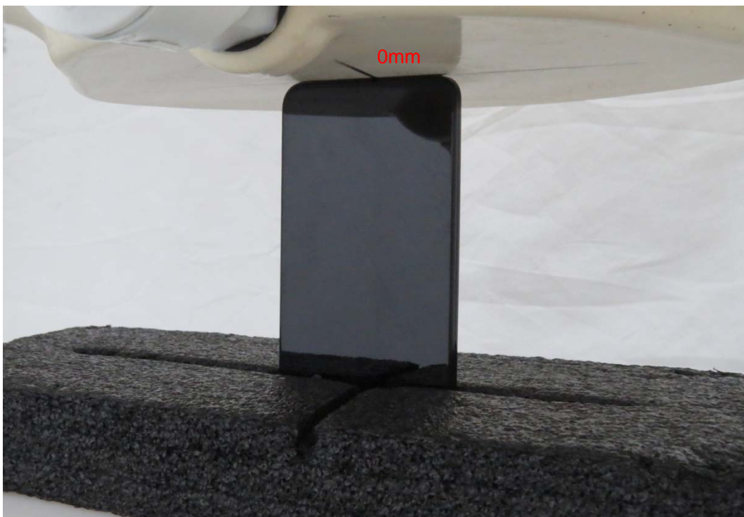
Picture 16: Bottom Edge, the distance from handset to the bottom of the Phantom is 0mm