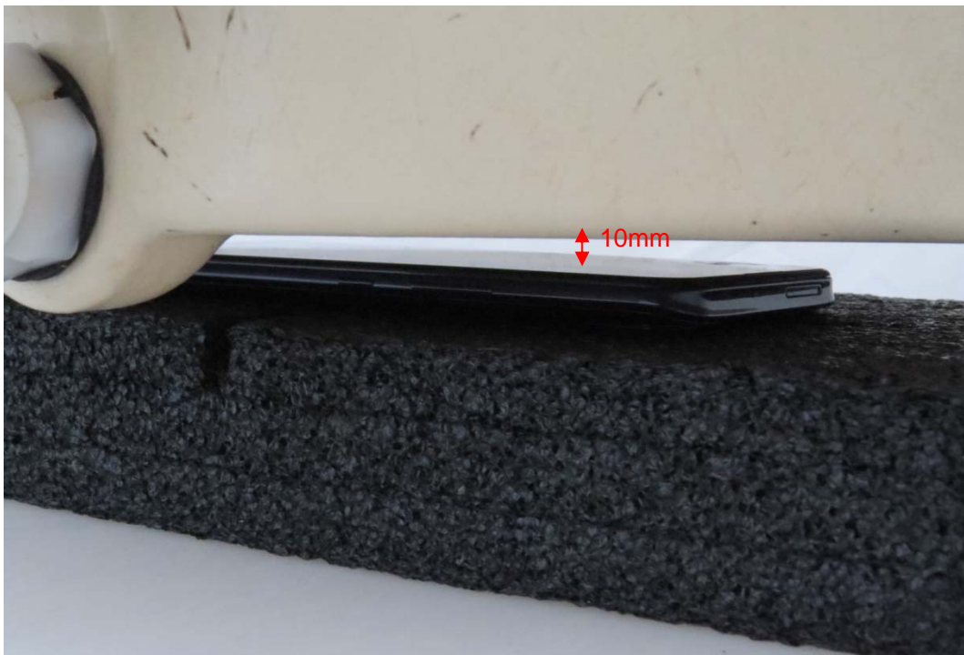
Picture 8: Front Side, the distance from handset to the bottom of the Phantom is 10mm