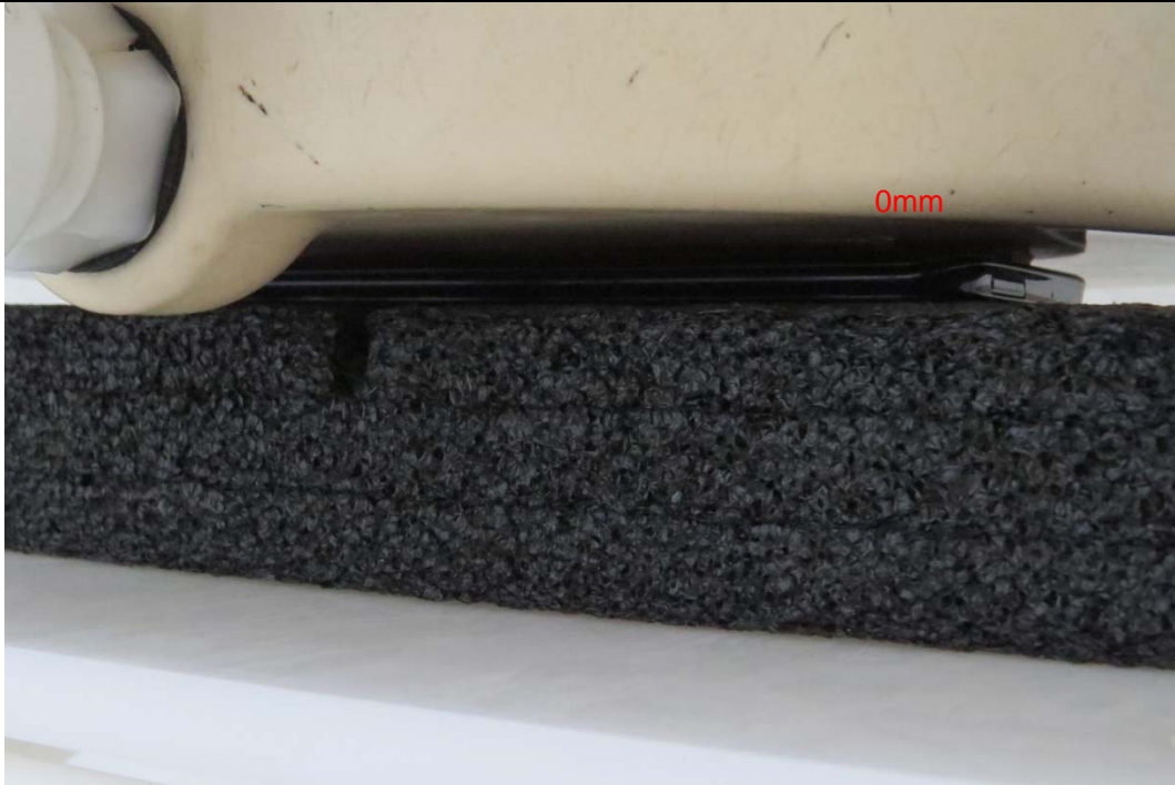
Picture 15: Back Side, the distance from handset to the bottom of the Phantom is 0mm