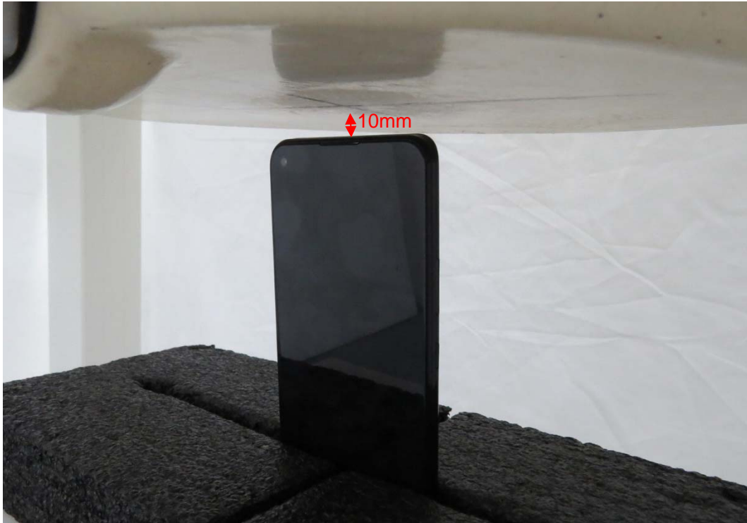
Picture 11: Top Side, the distance from handset to the bottom of the Phantom is 10mm