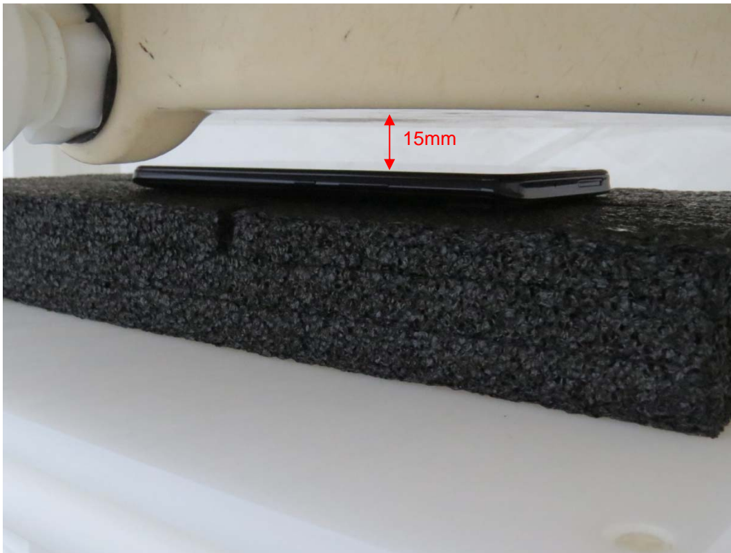
Picture 6: Front Side, the distance from handset to the bottom of the Phantom is 15mm