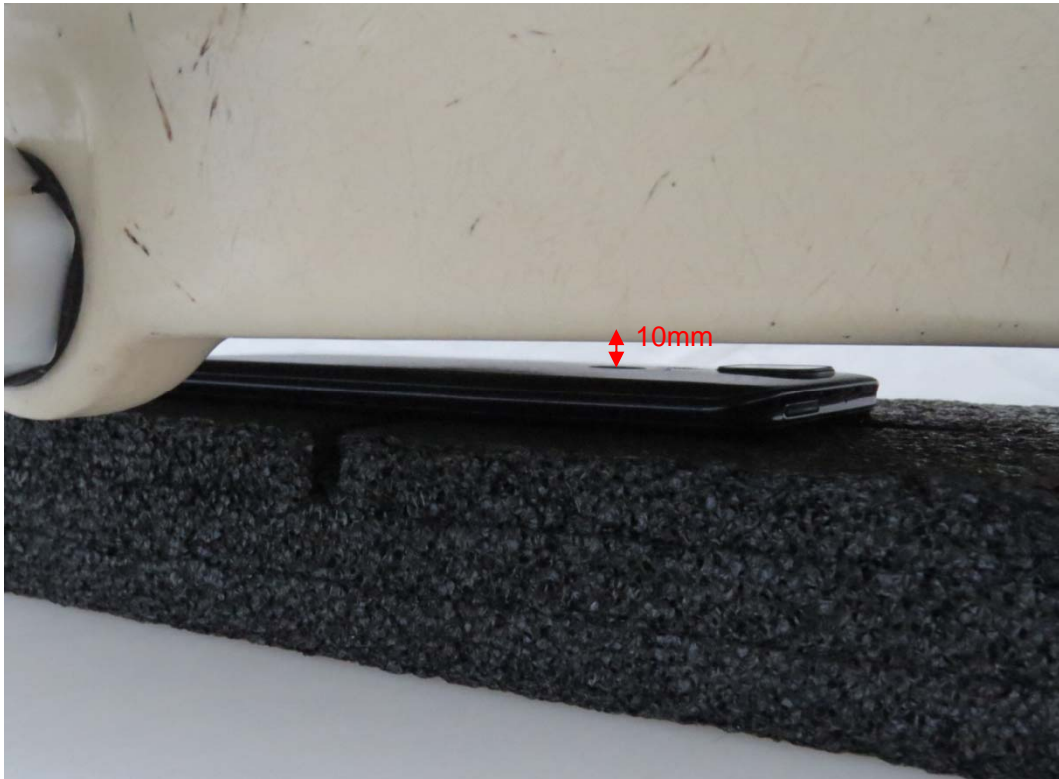
Picture 7: Back Side, the distance from handset to the bottom of the Phantom is 10mm