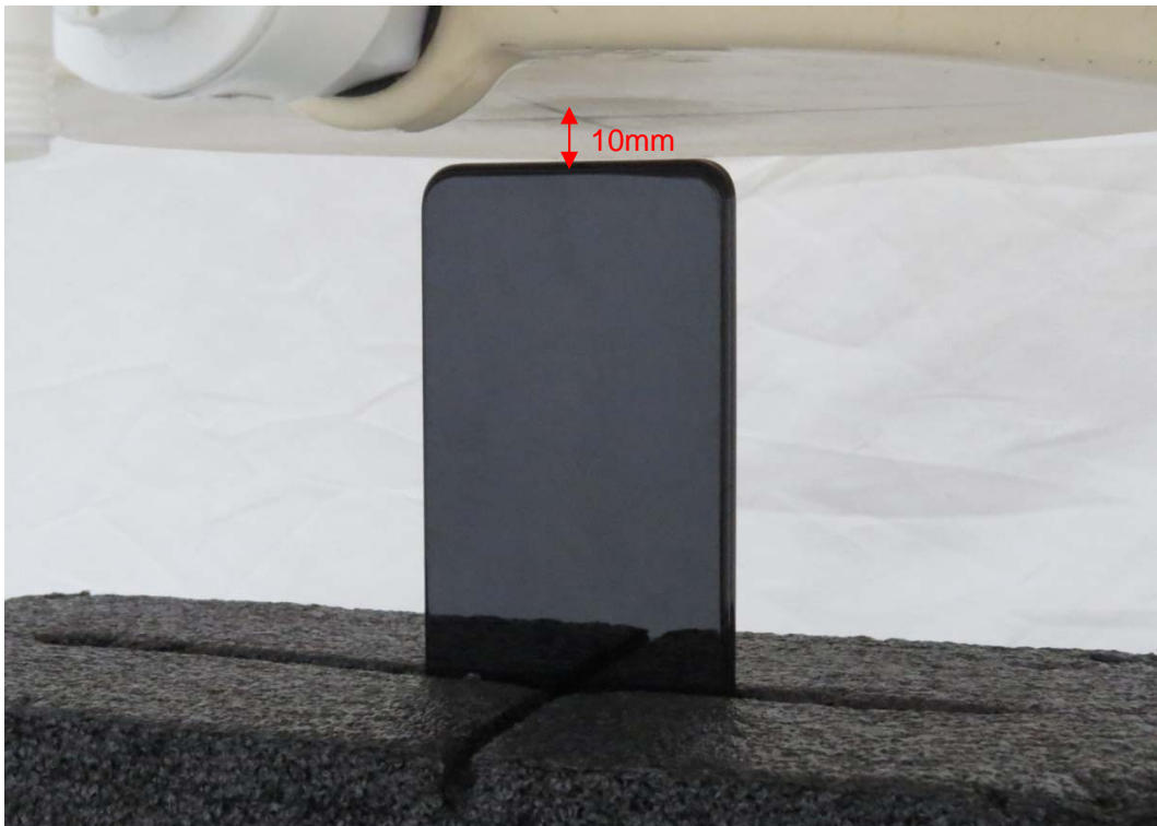
Picture 12: Bottom Edge, the distance from handset to the bottom of the Phantom is 10mm