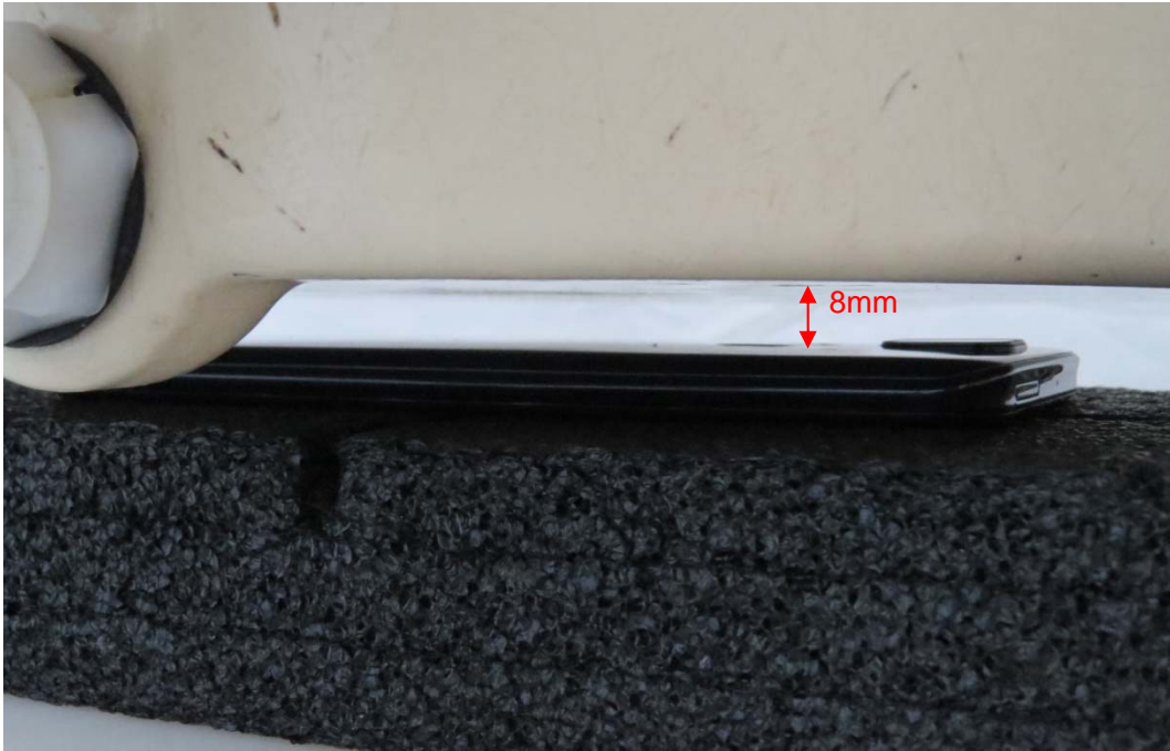
Picture 13: Back Side, the distance from handset to the bottom of the Phantom is 8mm