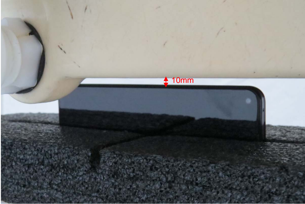
Picture 9: Left Side, the distance from handset to the bottom of the Phantom is 10mm