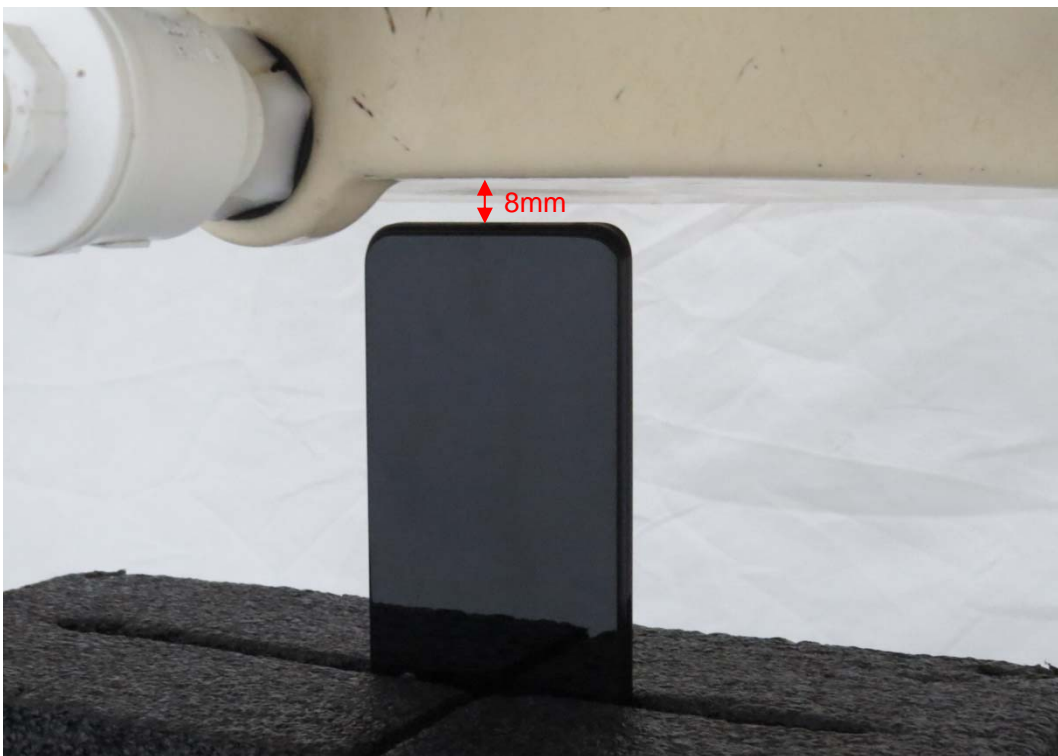
Picture 14: Bottom Edge, the distance from handset to the bottom of the Phantom is 8mm