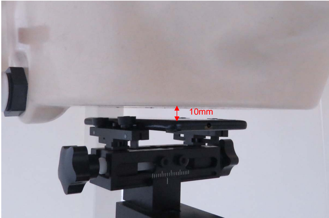
Picture 5: Back Side, the distance from handset to the bottom of the Phantom is 10mm