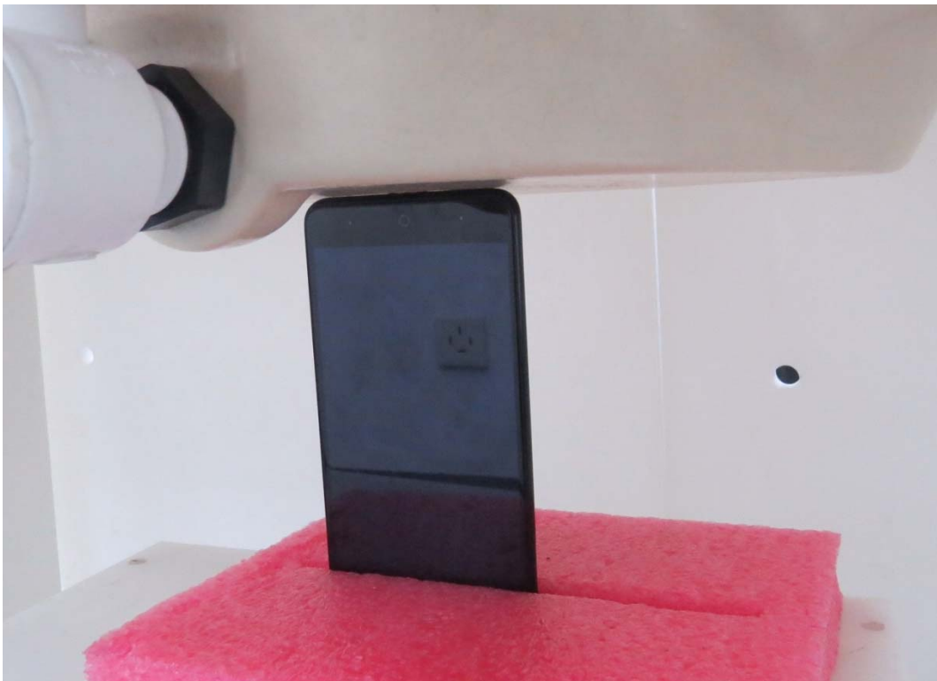
Picture 12: Bottom Edge, the distance from handset to the bottom of the Phantom is 0mm