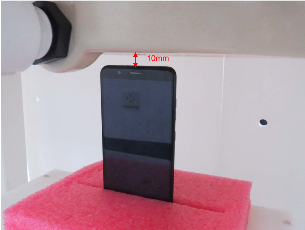
Picture 9: Top Side, the distance from handset to the bottom of the Phantom is 10mm