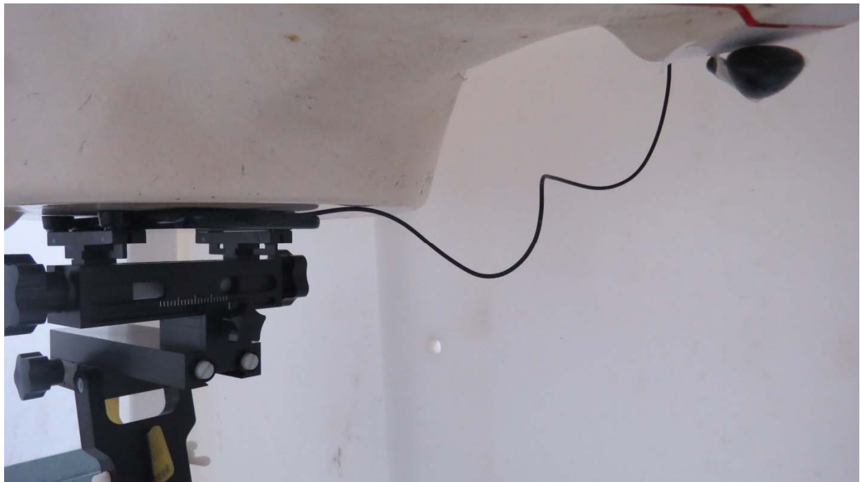
Picture 14: Back Side with Earphone, the distance from handset to the bottom of the Phantom is 0mm