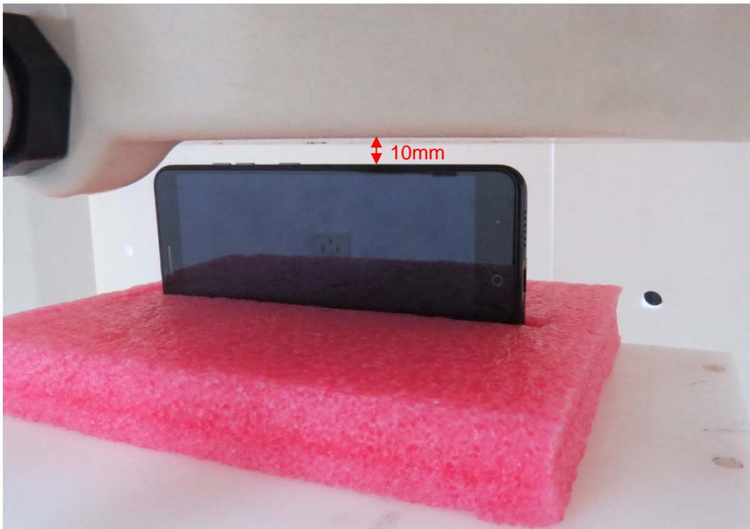
Picture 8: Right Side, the distance from handset to the bottom of the Phantom is 10mm