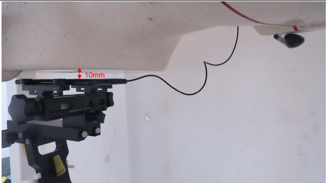
Picture 13: Back Side with Earphone, the distance from handset to the bottom of the Phantom is 10mm