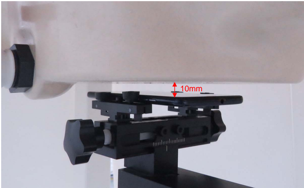
Picture 6: Front Side, the distance from handset to the bottom of the Phantom is 10mm