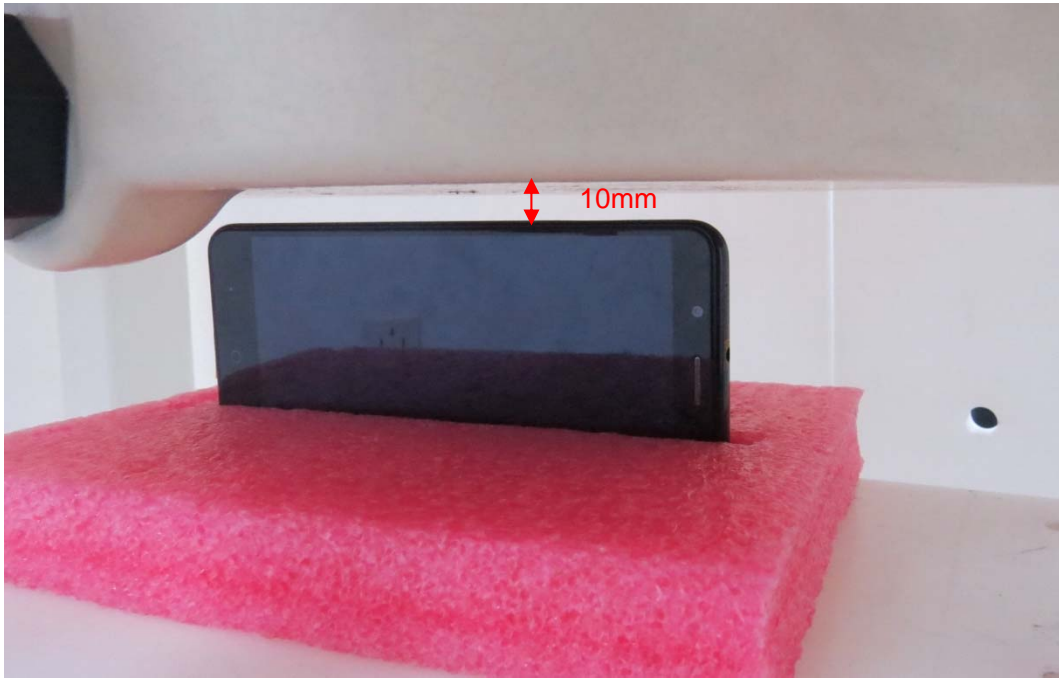
Picture 7: Left Side, the distance from handset to the bottom of the Phantom is 10mm