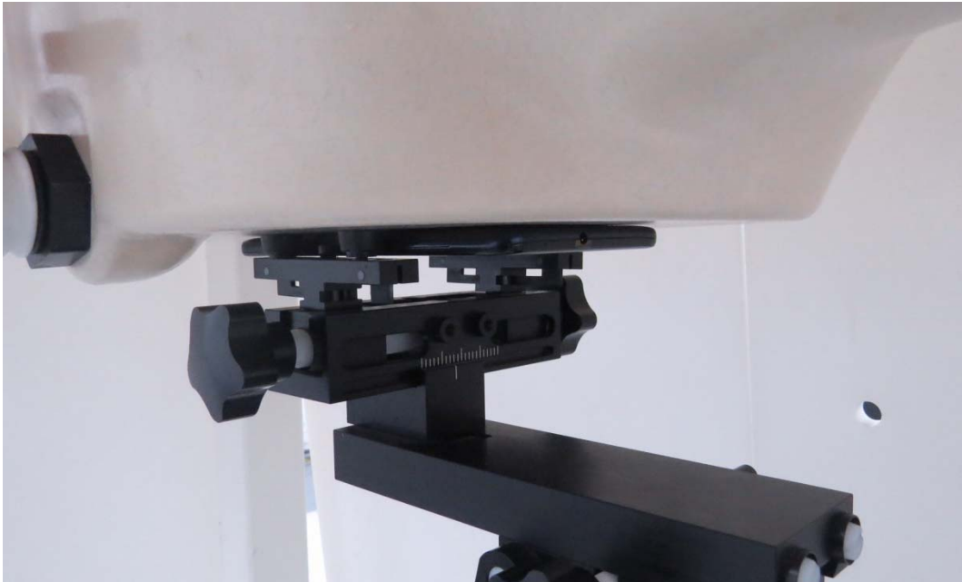
Picture 11: Back Side, the distance from handset to the bottom of the Phantom is 0mm