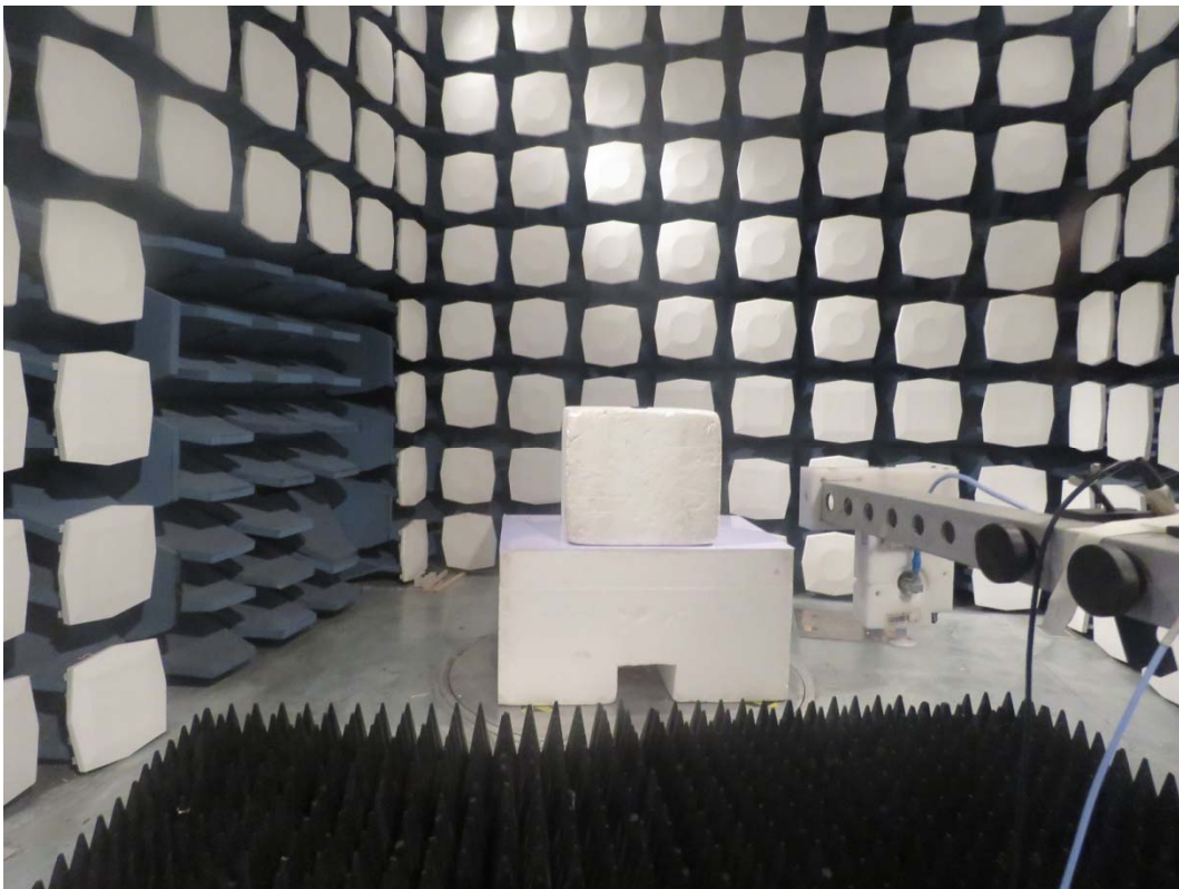
18GHz - 26.5GHz