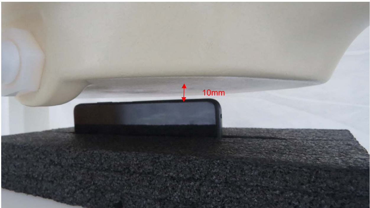
Picture 10: Right Side, the distance from handset to the bottom of the Phantom is 10mm