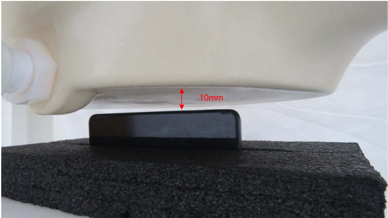
Picture 9: Left Side, the distance from handset to the bottom of the Phantom is 10mm