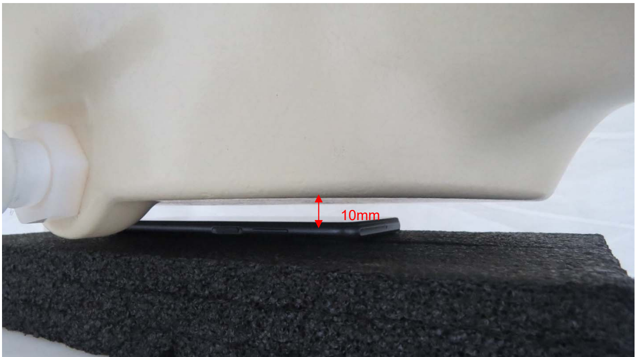
Picture 8: Front Side, the distance from handset to the bottom of the Phantom is 10mm