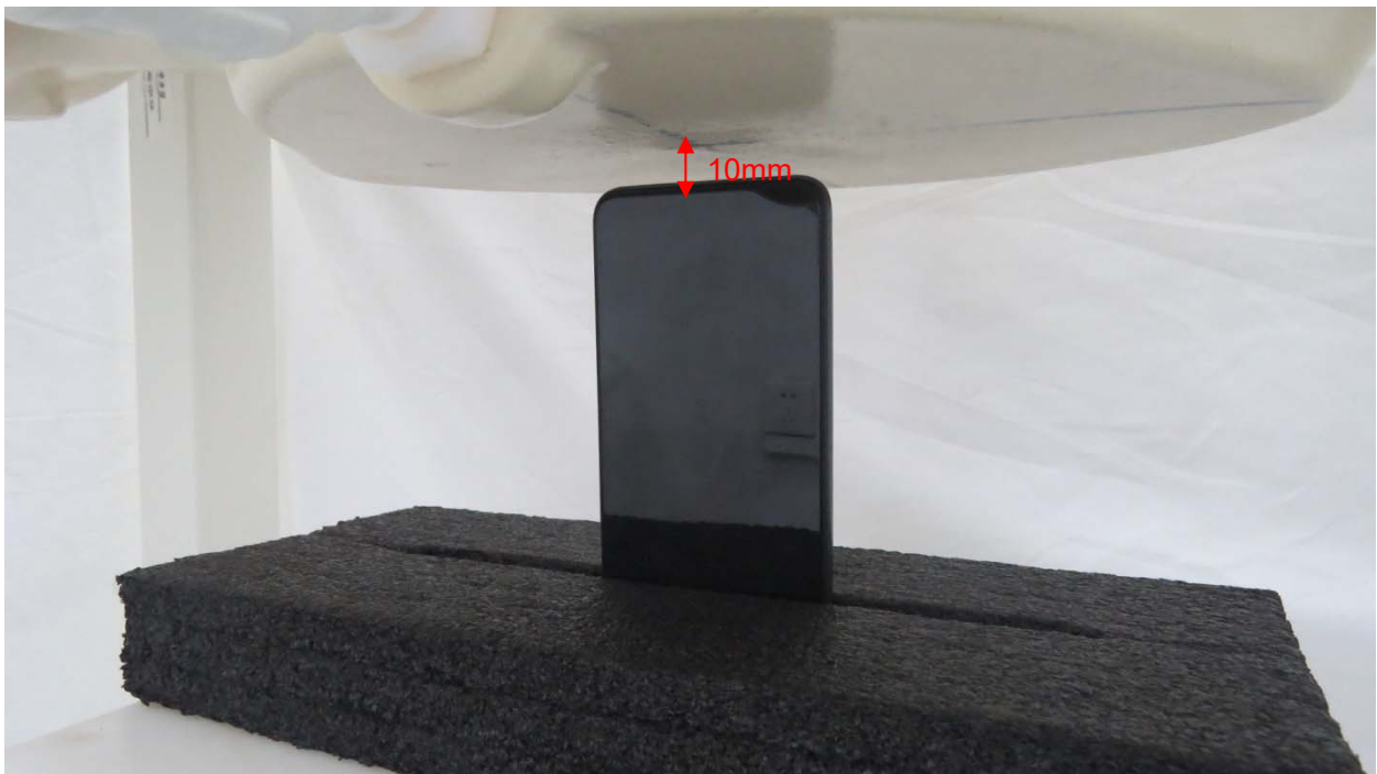
Picture 12: Bottom Edge, the distance from handset to the bottom of the Phantom is 10mm