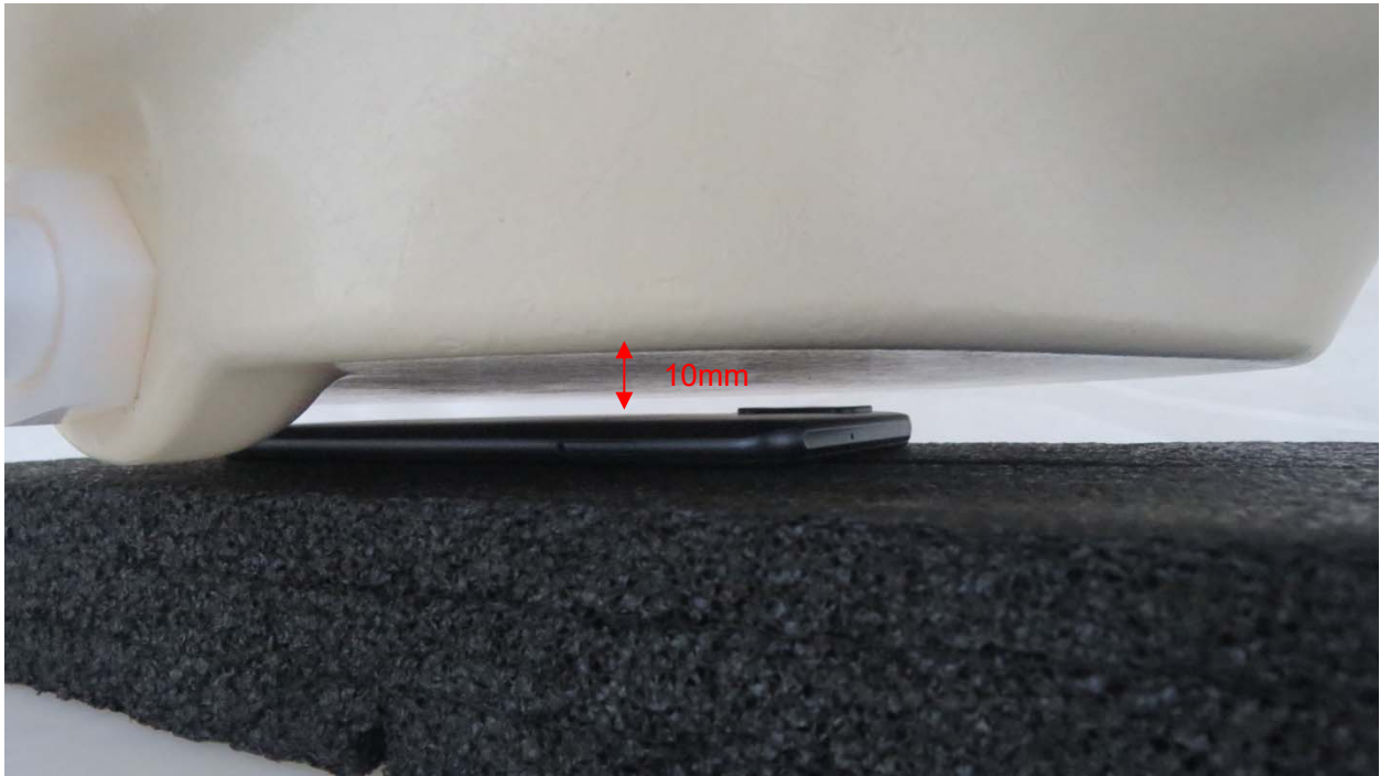
Picture 7: Back Side, the distance from handset to the bottom of the Phantom is 10mm