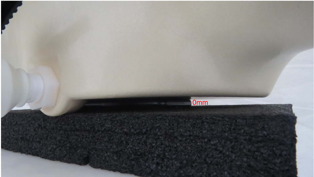
Picture 13: Back Side, the distance from handset to the bottom of the Phantom is 0mm