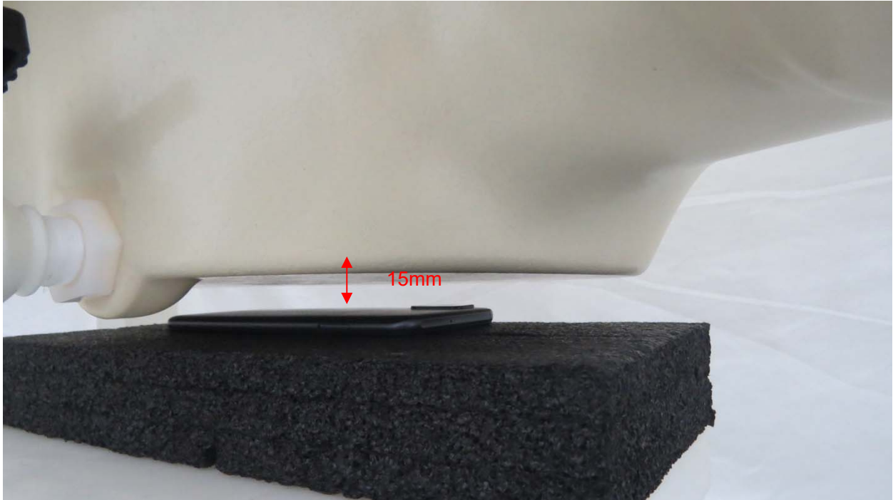
Picture 5: Back Side, the distance from handset to the bottom of the Phantom is 15mm