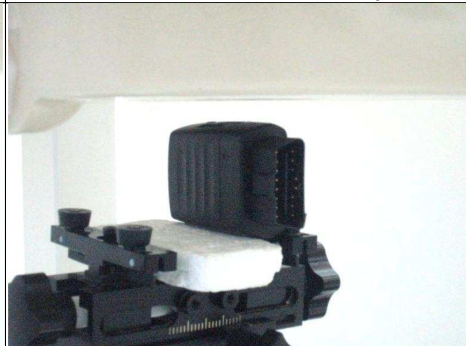
Right Side of EUT with 1.0 cm Gap