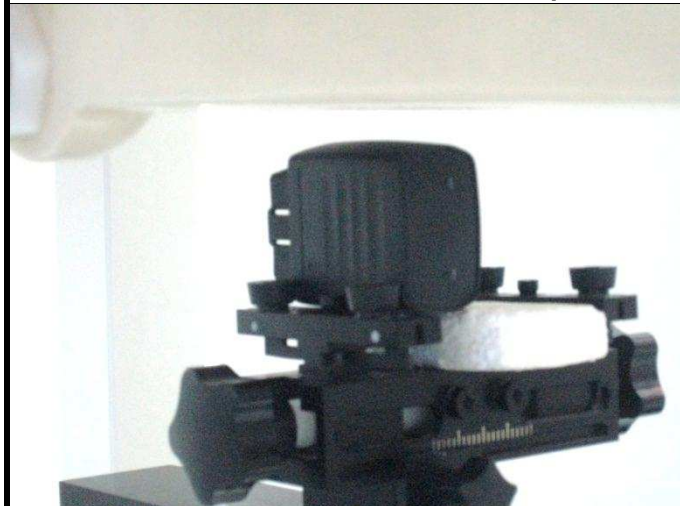
Left Side of EUT with 1.0 cm Gap