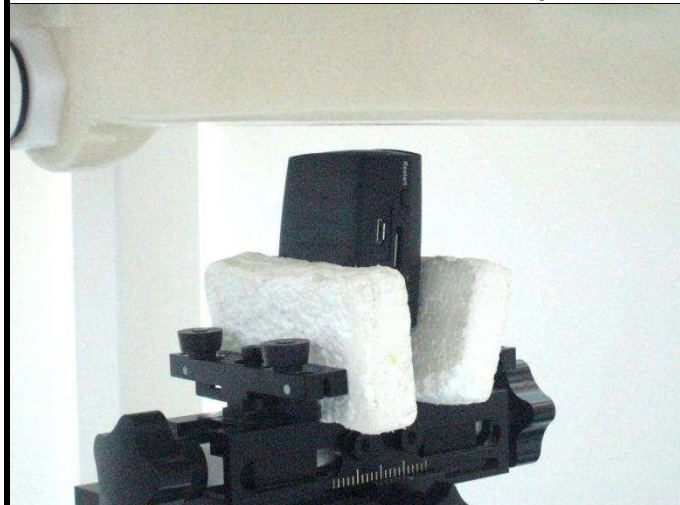
Bottom Side of EUT with 1.0 cm Gap