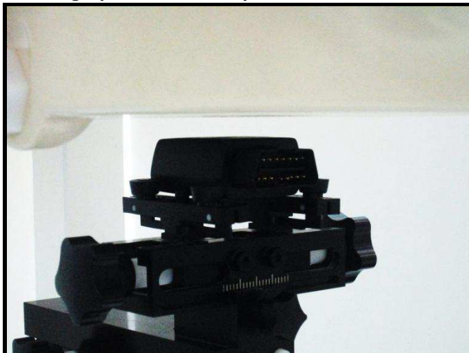
Front Face of EUT with 1.0 cm Gap