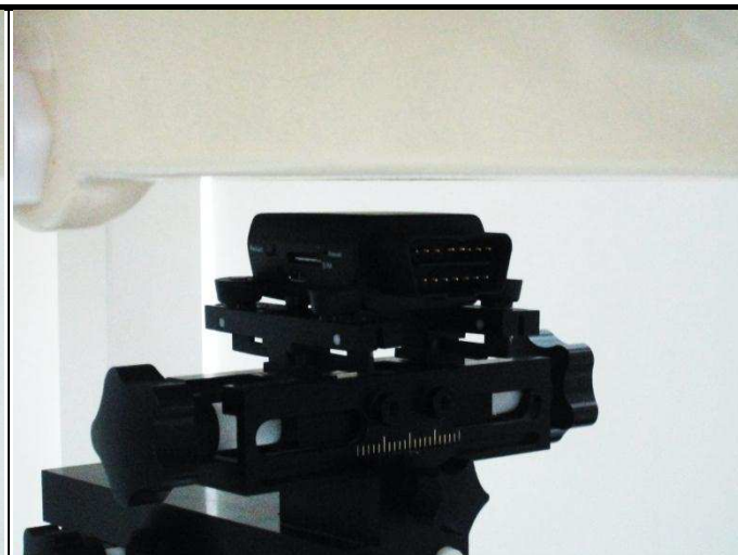
Rear Face of EUT with 1.0 cm Gap