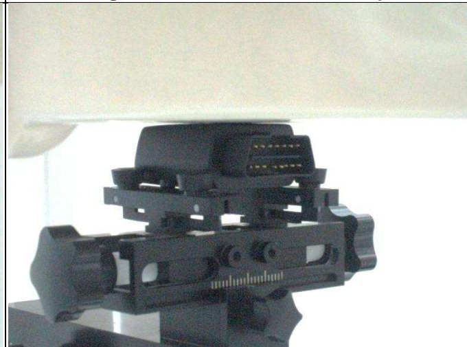
Front Face of EUT with 0 cm Gap