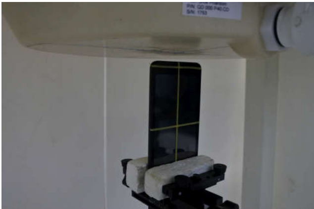
Top Side, Test Separation 10 mm