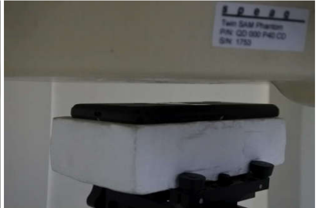
Back, Test Separation 15 mm