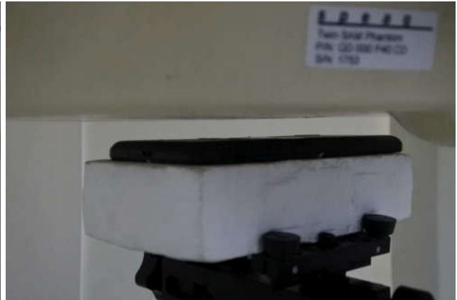
Back, Test Separation 10 mm