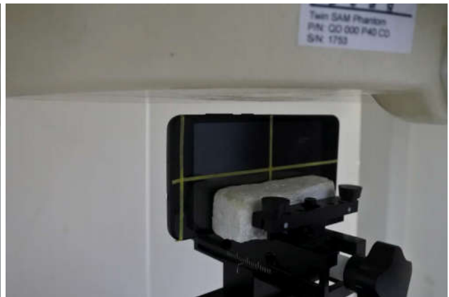
Right Side, Test Separation 10 mm