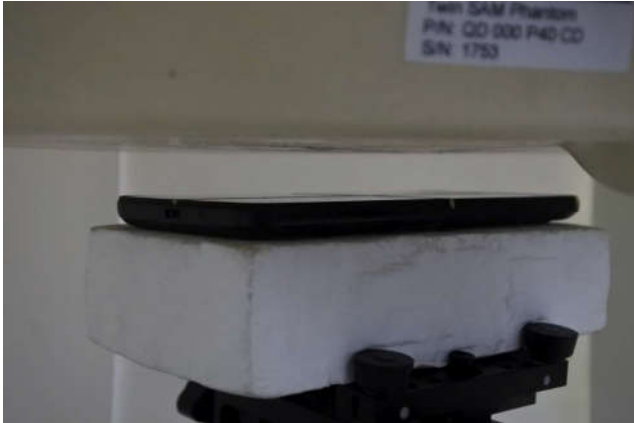
Front, Test Separation 15 mm