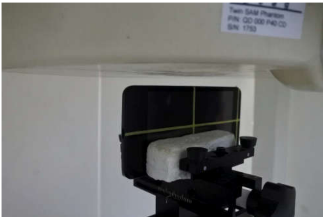
Left Side, Test Separation 10 mm