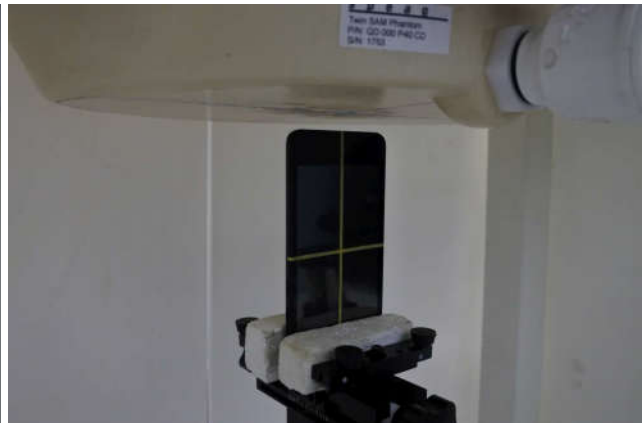
Bottom Side, Test Separation 10 mm