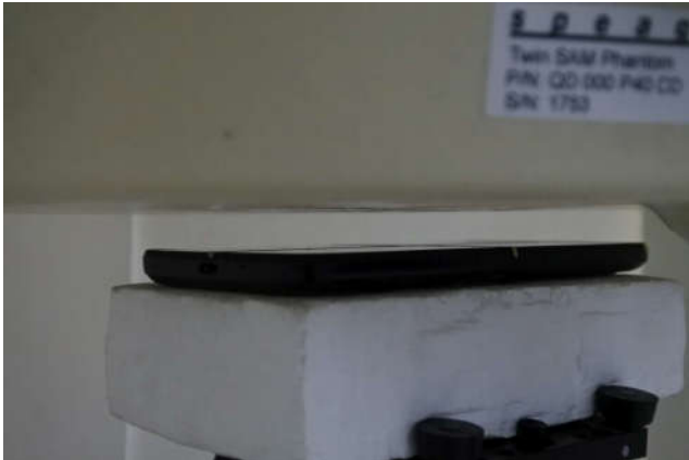
Front, Test Separation 10 mm