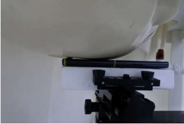
Right Cheek ,Test Separation 0 mm