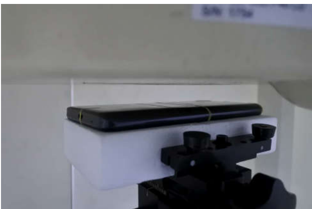
Back, Test Separation 15 mm