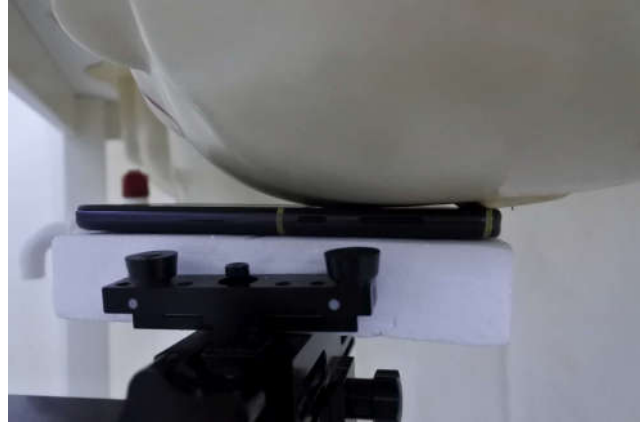
Left Cheek, Test Separation 0 mm