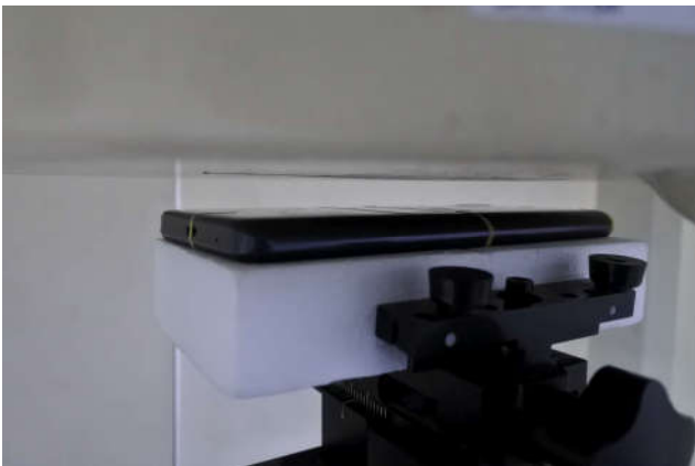
Back, Test Separation 10 mm