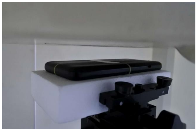
Back, Test Separation 15 mm