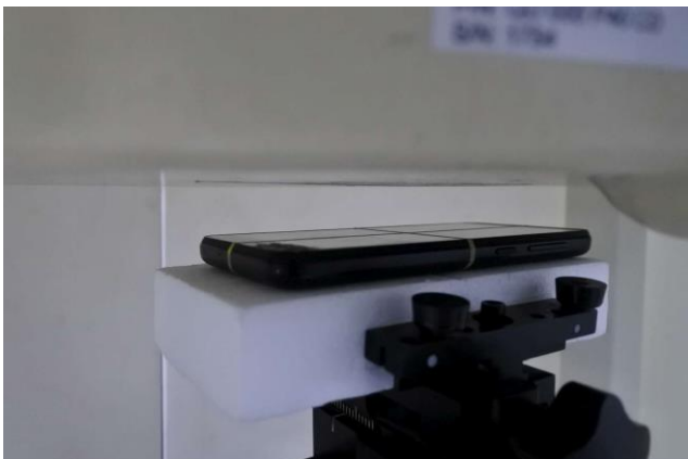
Front, Test Separation 15 mm