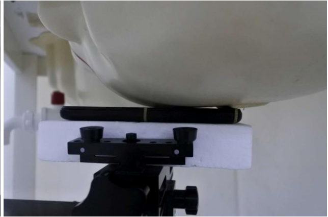
Left Cheek, Test Separation 0 mm