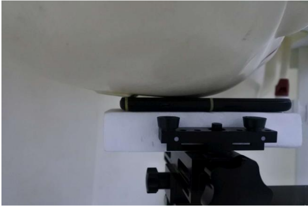
Right Cheek ,Test Separation 0 mm