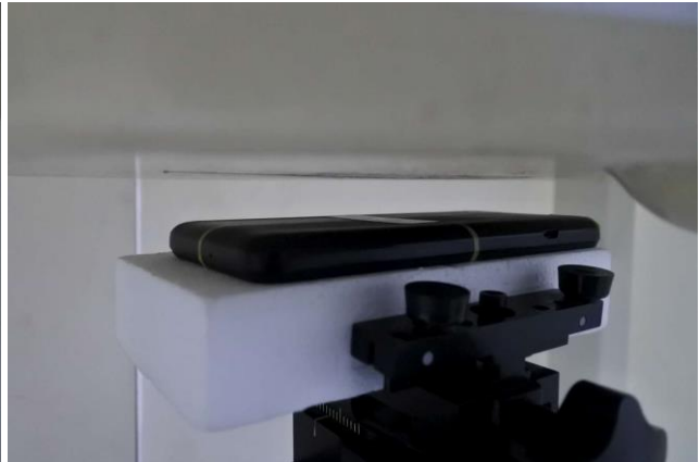
Back, Test Separation 10 mm