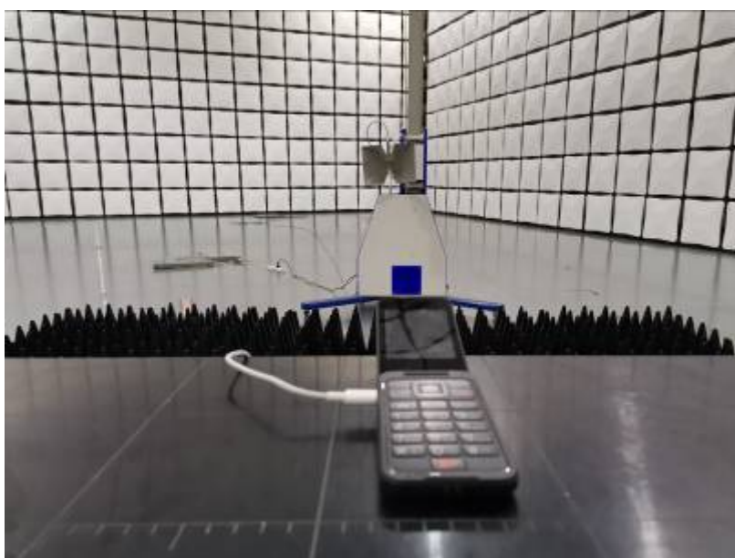
Radiated Emissions Test Setup (above1GHz)