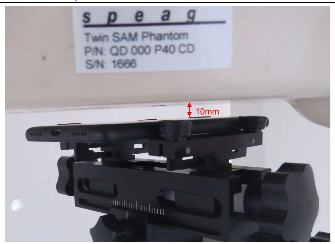
Picture 7: Back Side, the distance from handset to the bottom of the Phantom is 10mm