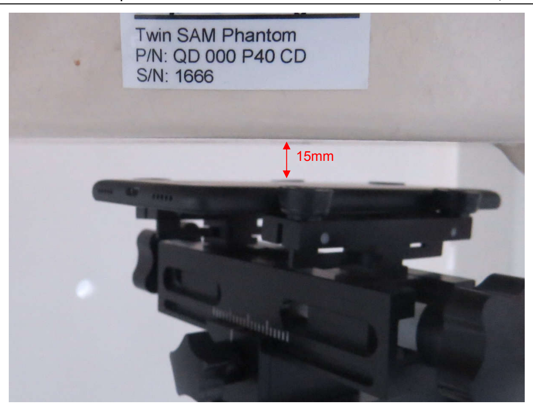
Picture 5: Back Side, the distance from handset to the bottom of the Phantom is 15mm