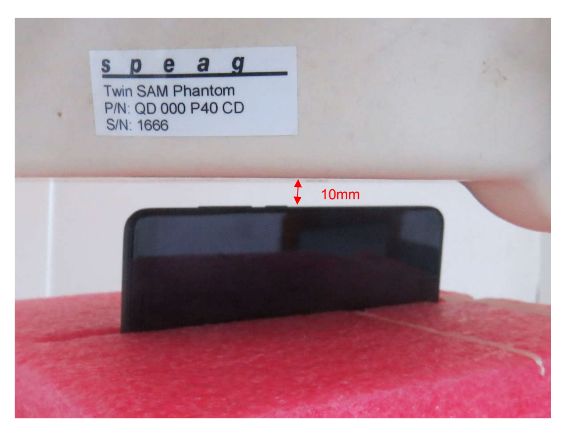
Picture 10: Right Side, the distance from handset to the bottom of the Phantom is 10mm