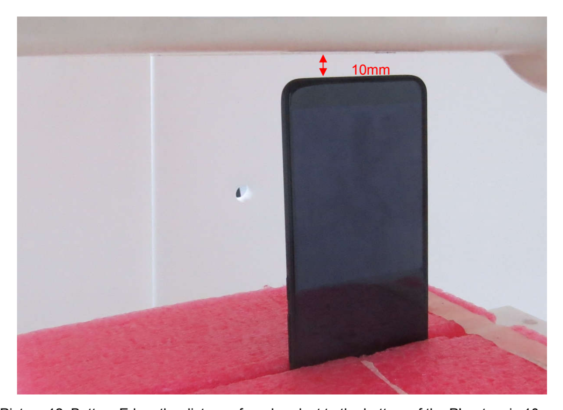
Picture 12: Bottom Edge, the distance from handset to the bottom of the Phantom is 10mm