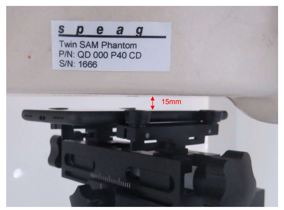
Picture 6: Front Side, the distance from handset to the bottom of the Phantom is 15mm