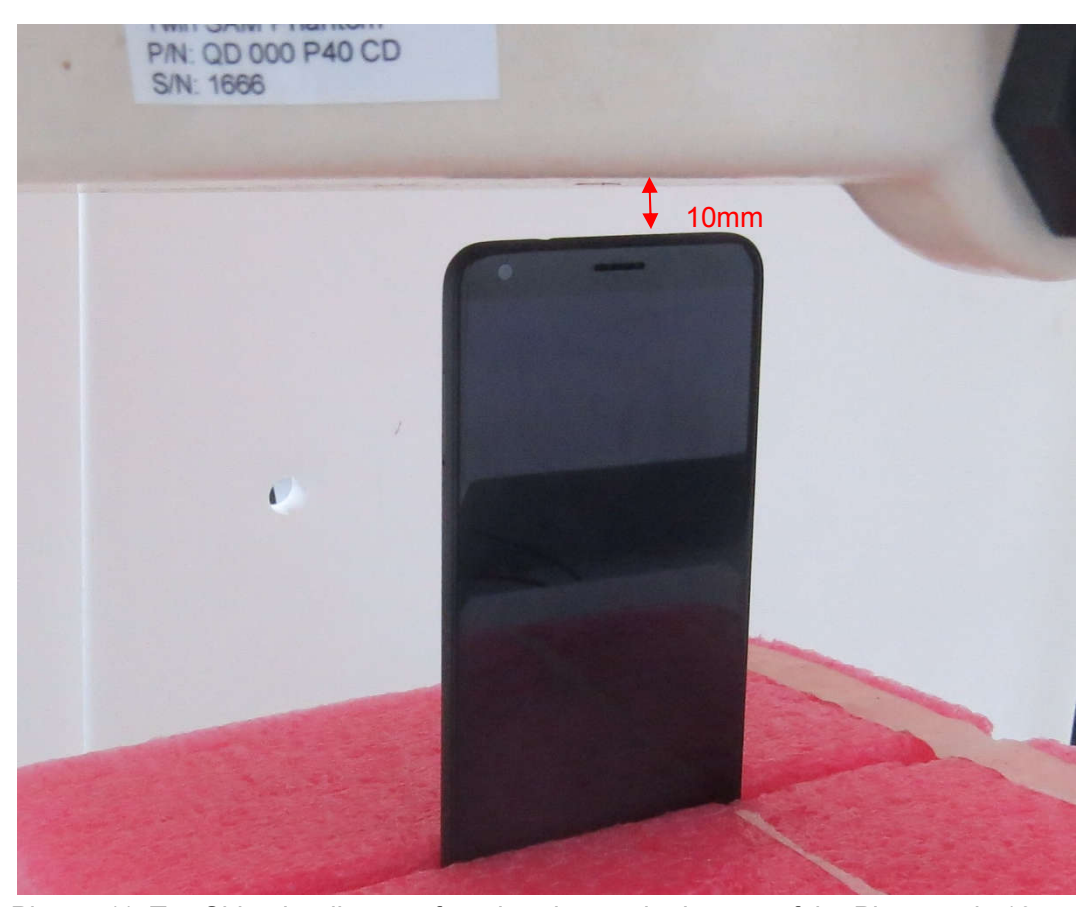
Picture 11: Top Side, the distance from handset to the bottom of the Phantom is 10mm