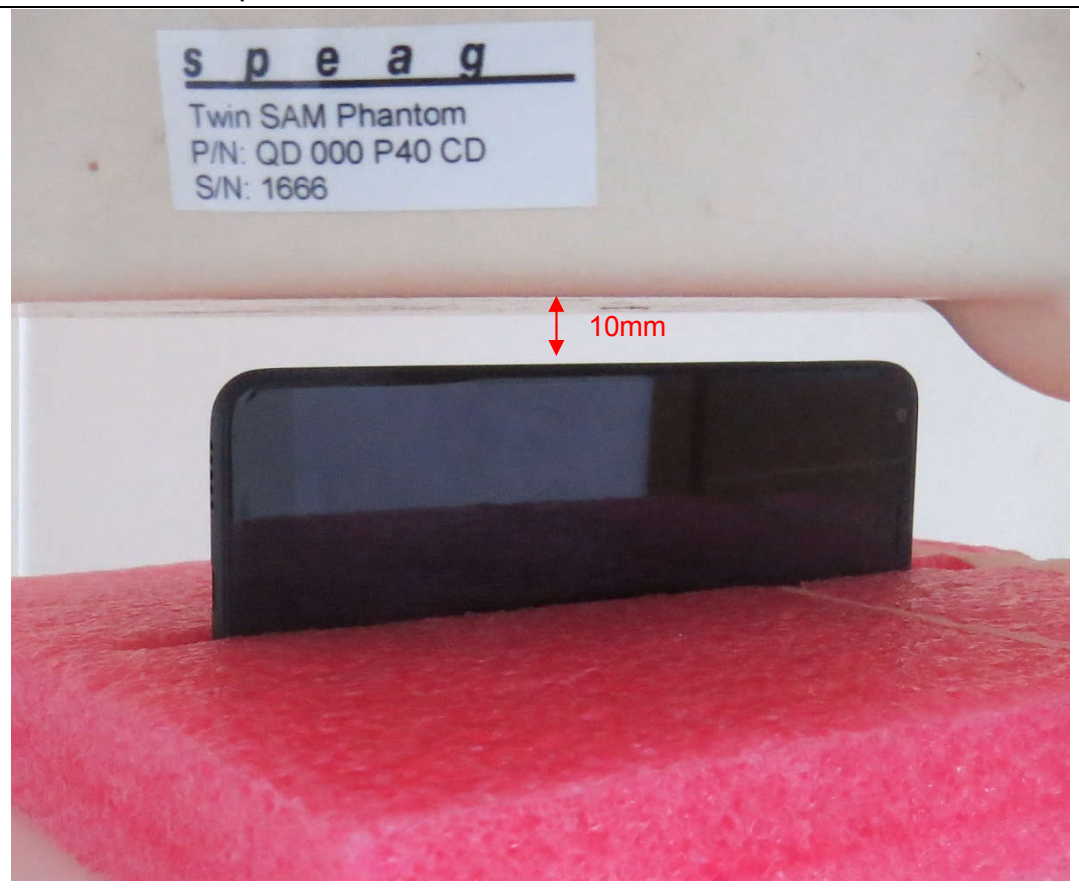
Picture 9: Left Side, the distance from handset to the bottom of the Phantom is 10mm