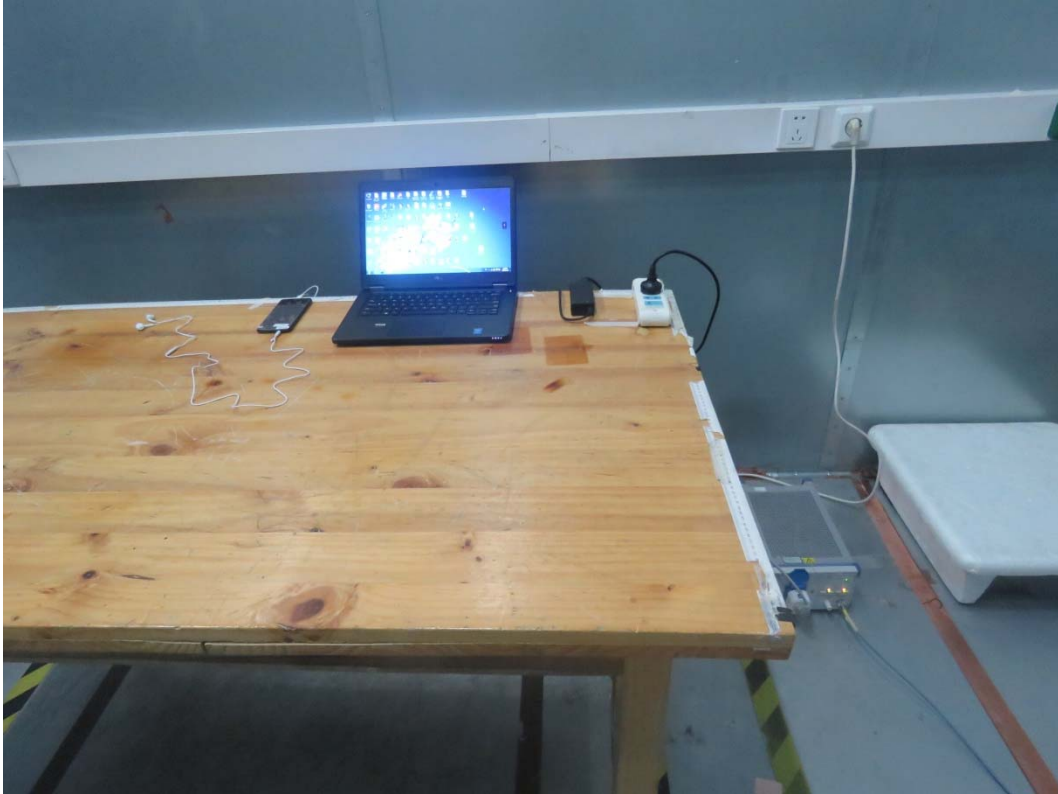
Picture 2 Conducted Emission Test Setup