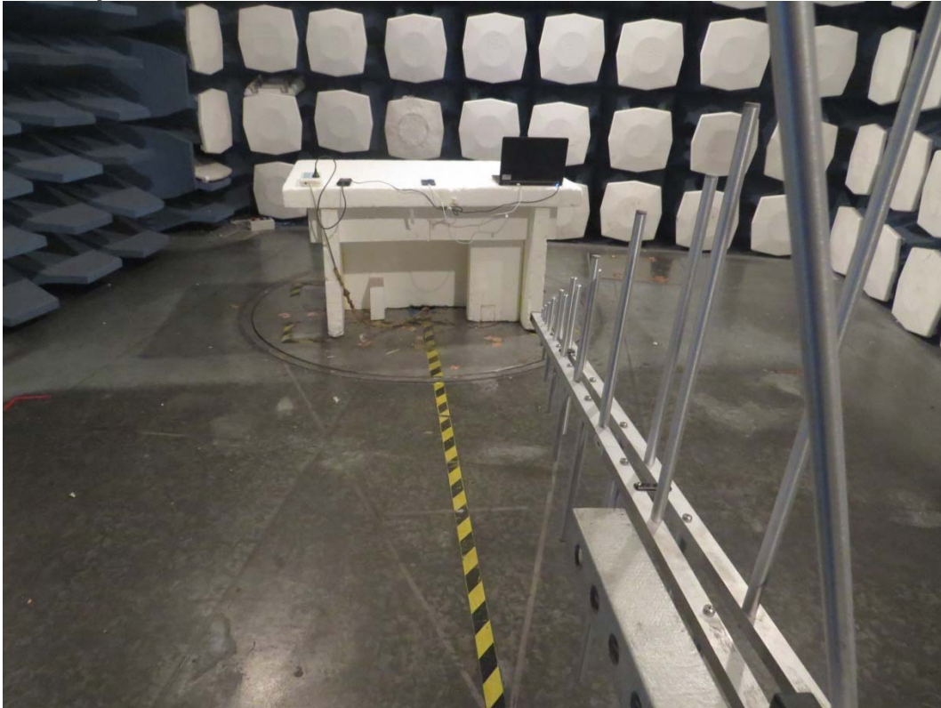
a: Below 1GHz