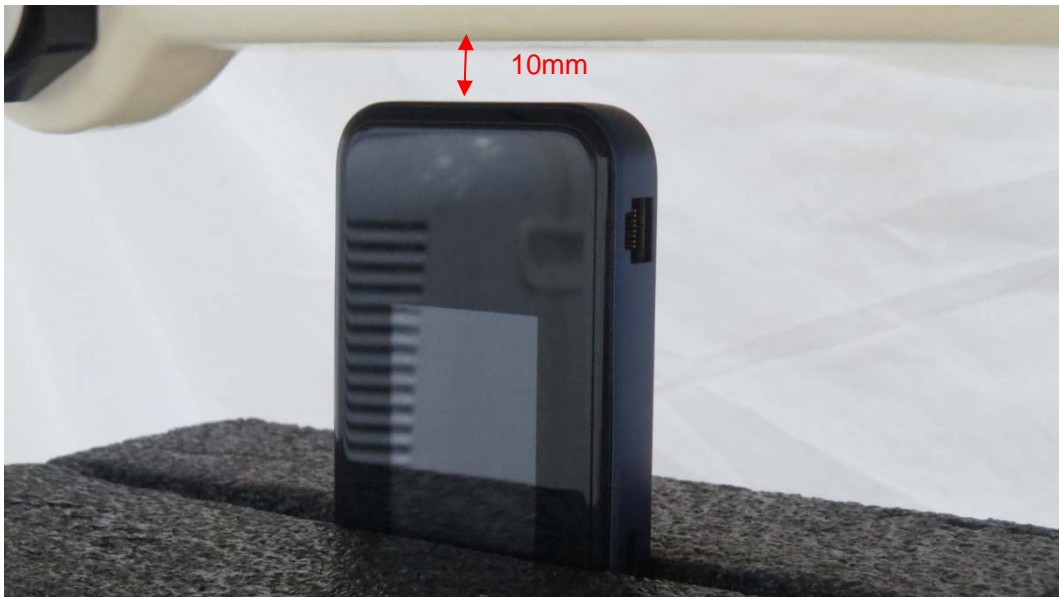
Picture 4: Right Side, the distance from handset to the bottom of the Phantom is 10mm