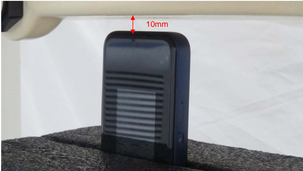
Picture 3: Left Side, the distance from handset to the bottom of the Phantom is 10mm