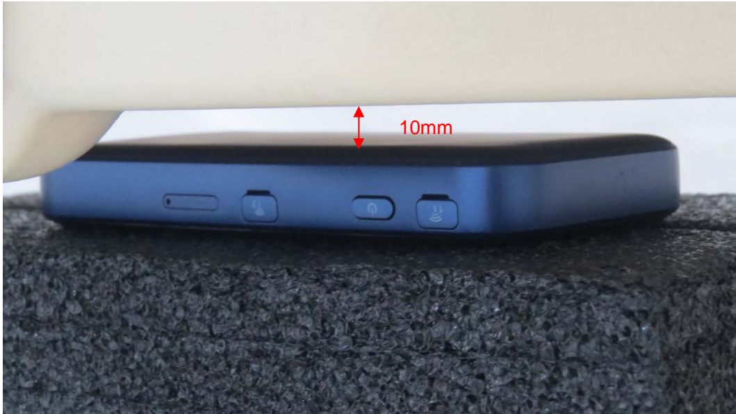
Picture 1: Back Side, the distance from handset to the bottom of the Phantom is 10mm