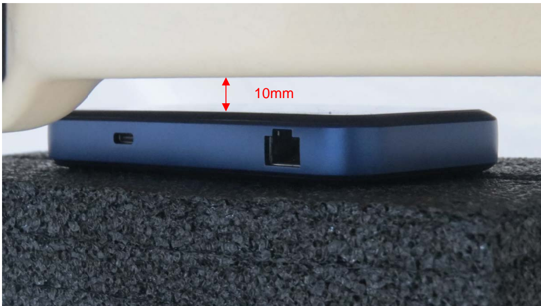
Picture 2: Front Side, the distance from handset to the bottom of the Phantom is 10mm