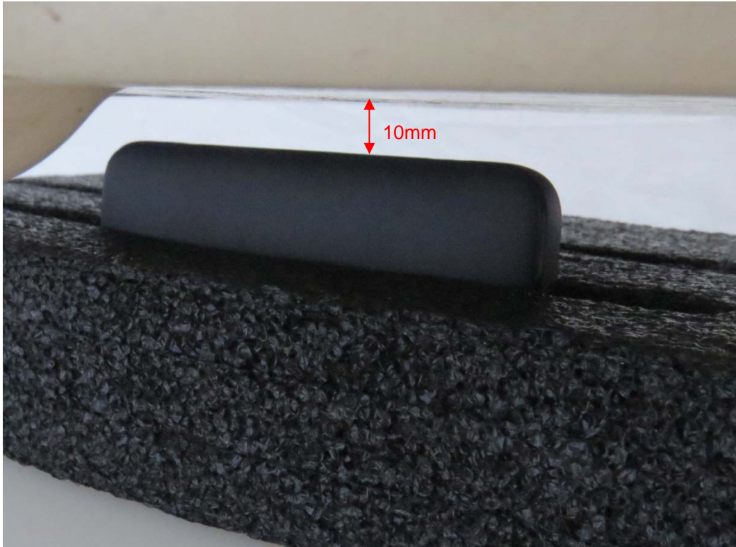
Picture 5: Top Side, the distance from handset to the bottom of the Phantom is 10mm