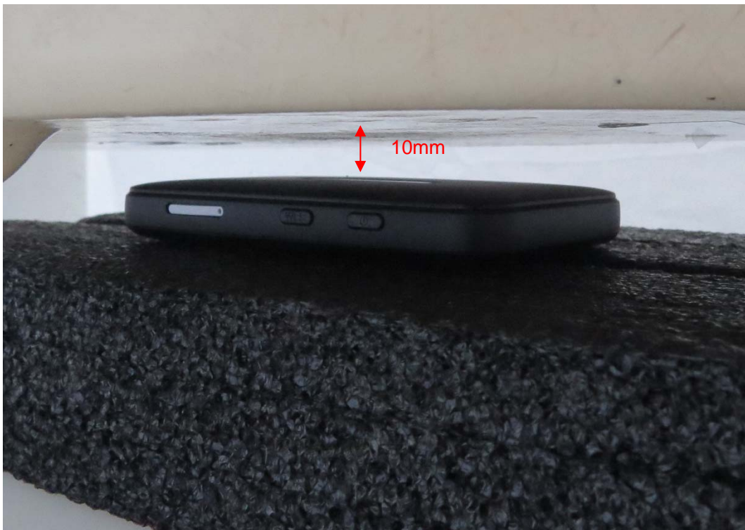
Picture 2: Front Side, the distance from handset to the bottom of the Phantom is 10mm