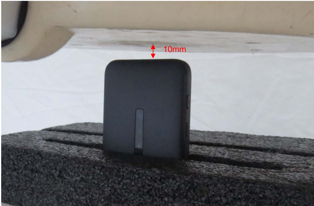
Picture 3: Left Side, the distance from handset to the bottom of the Phantom is 10mm