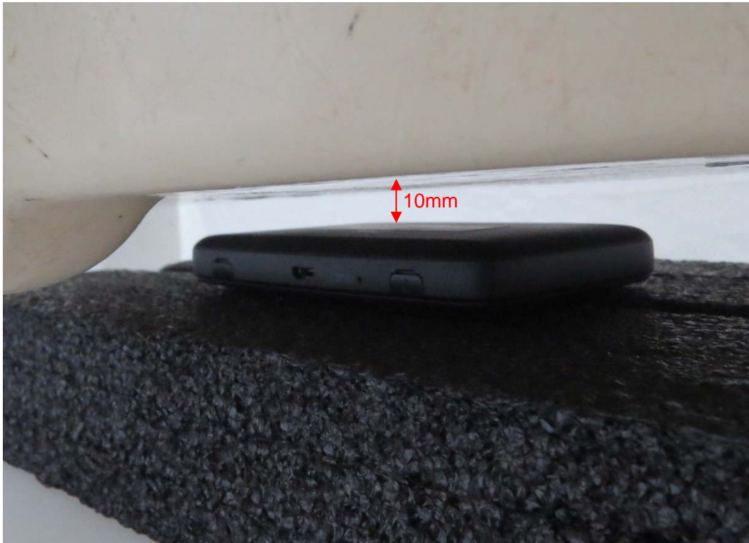
Picture 1: Back Side, the distance from handset to the bottom of the Phantom is 10mm