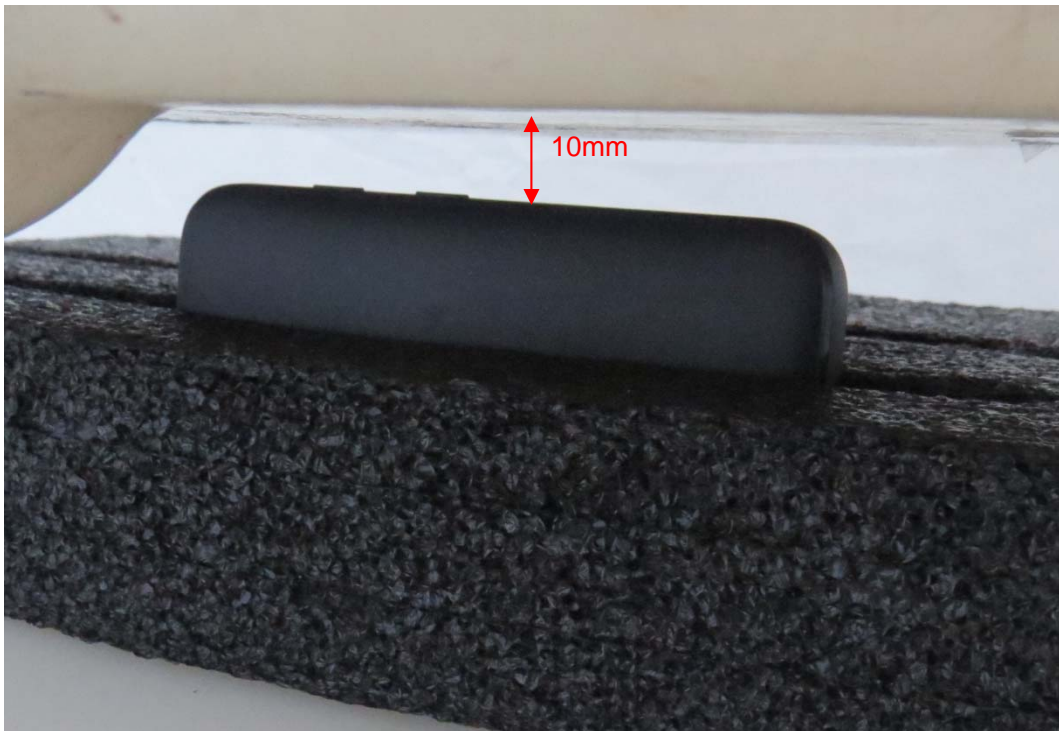
Picture 6: Bottom Edge, the distance from handset to the bottom of the Phantom is 10mm