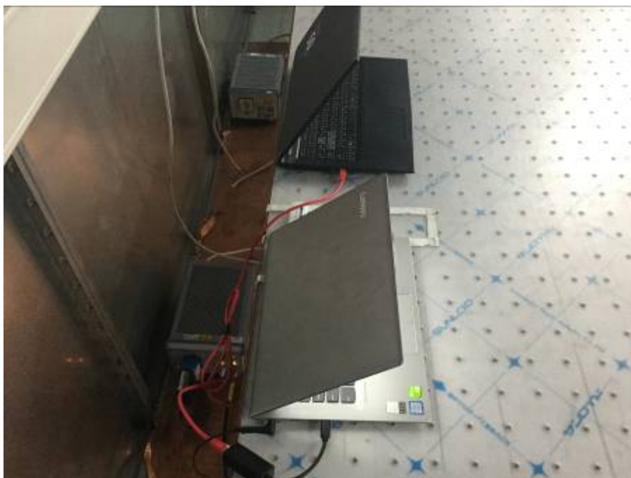
Conducted Emissions Test Setup (with laptop)