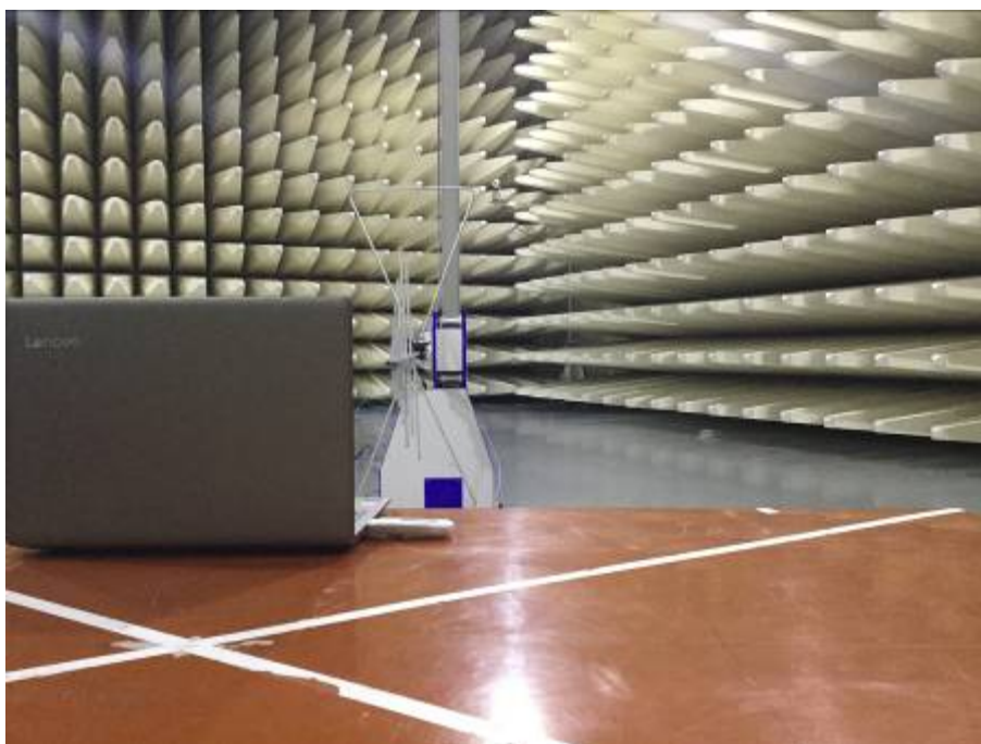
Radiated Emissions Test Setup (with laptop) (30-1000MHz)