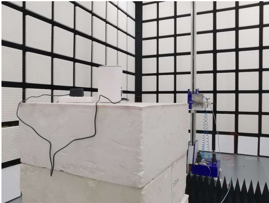
Field Strength of Spurious Radiation (3GHz - 10GHz)