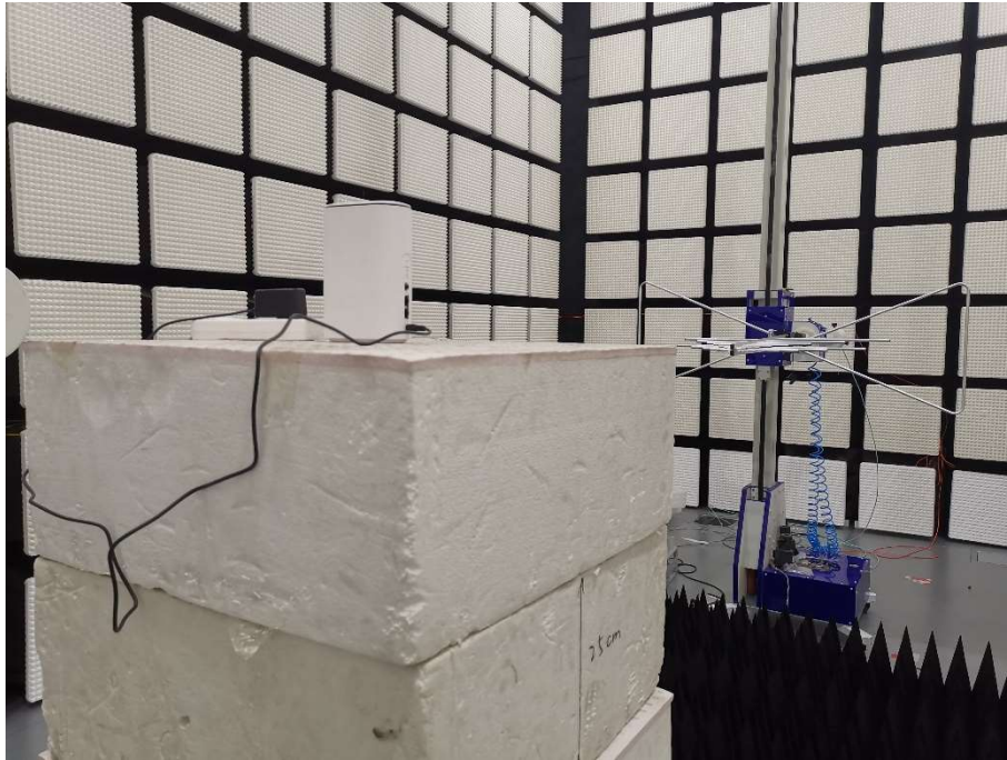
Field Strength of Spurious Radiation (1GHz - 3GHz)