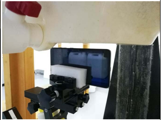
Right Edge of EUT with 1.0cm Gap