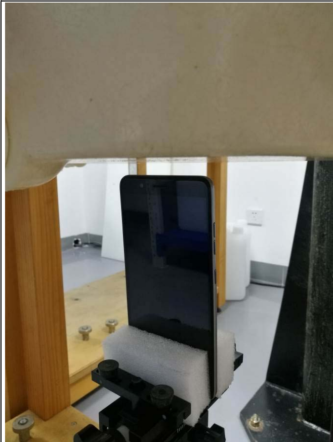
Top Edge of EUT with 1.0 cm Gap