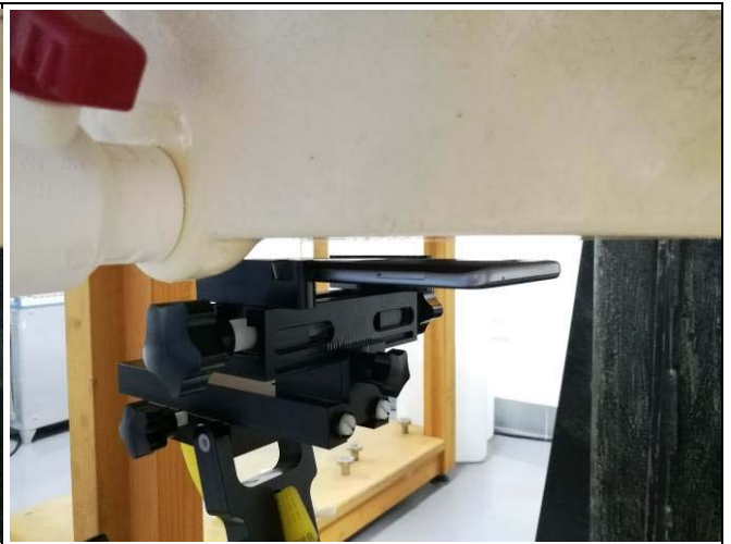
Back Side of EUT with 1.0cm Gap