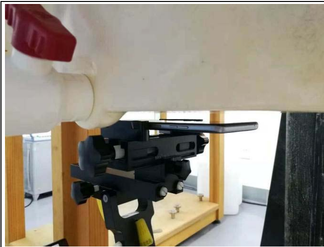
Front Side of EUT with 1.0 cm Gap