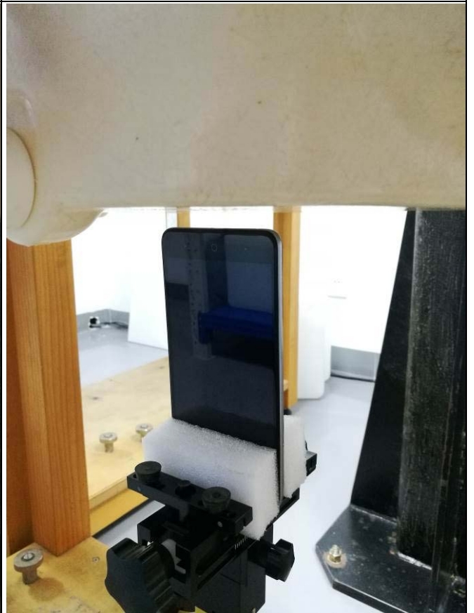
Bottom Edge of EUT with 1.0cm Gap