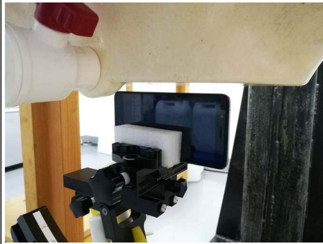
Left Edge of EUT with 1.0 cm Gap