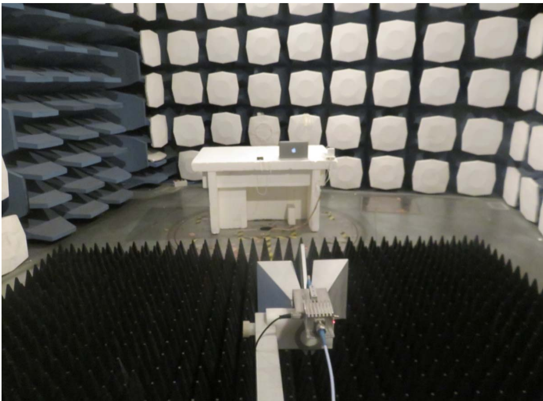
b: Above 1GHz