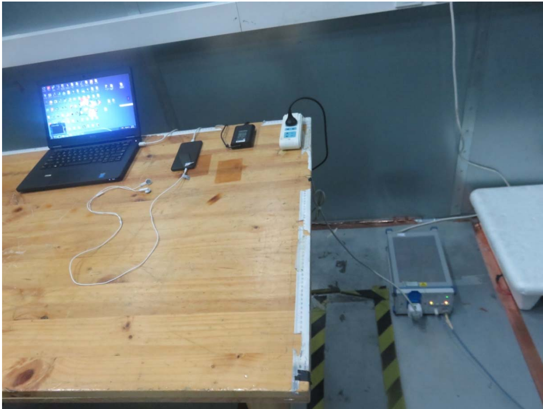
Picture 2 Conducted Emission Test Setup