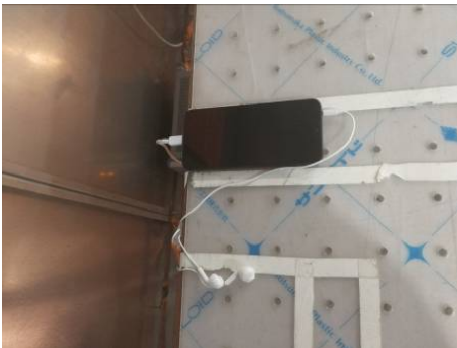
Conducted Emissions Test Setup (with charger)