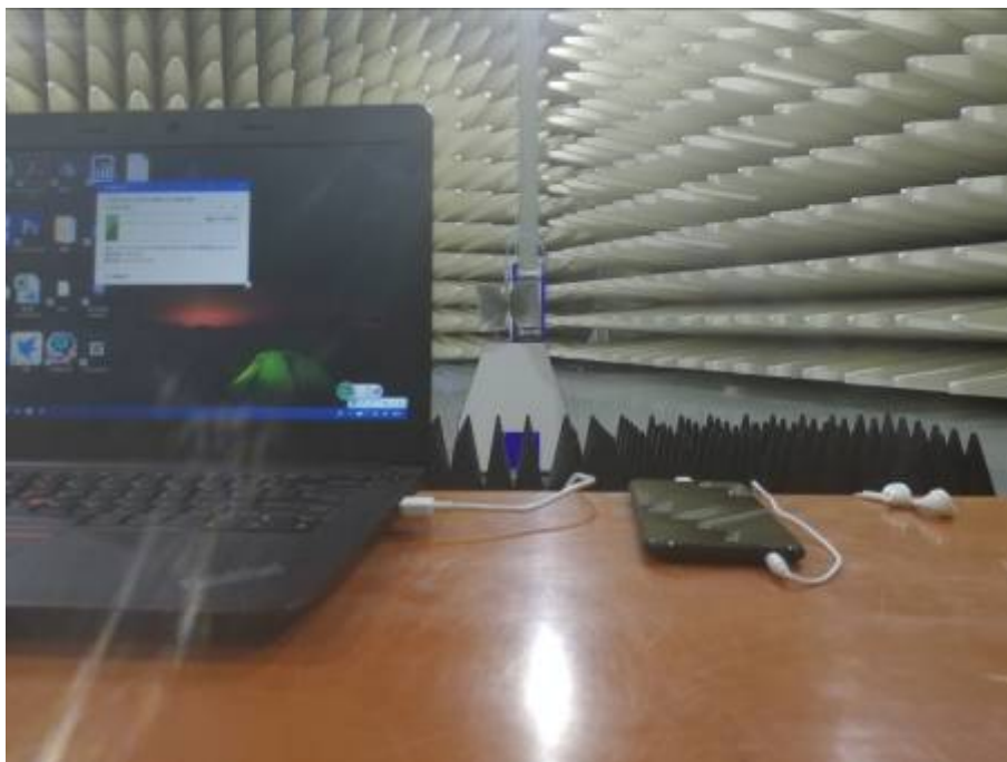
Radiated Emissions Test Setup (with laptop) (above 1GHz)