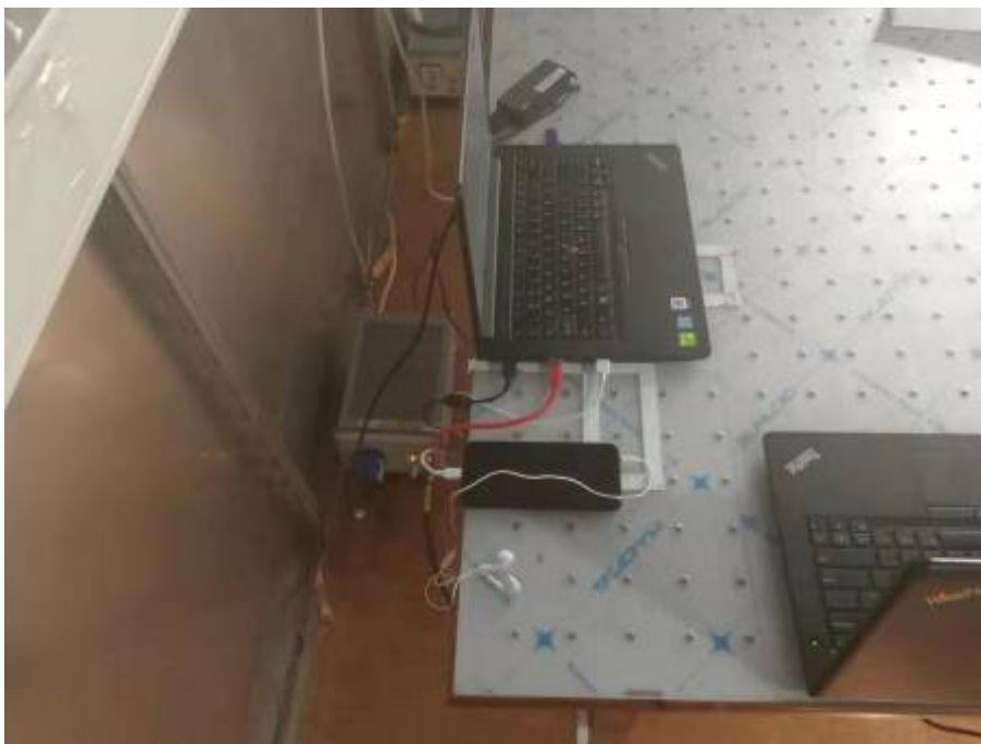
Conducted Emissions Test Setup (with laptop)