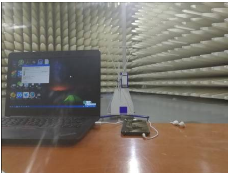
Radiated Emissions Test Setup (with laptop) (30-1000MHz)