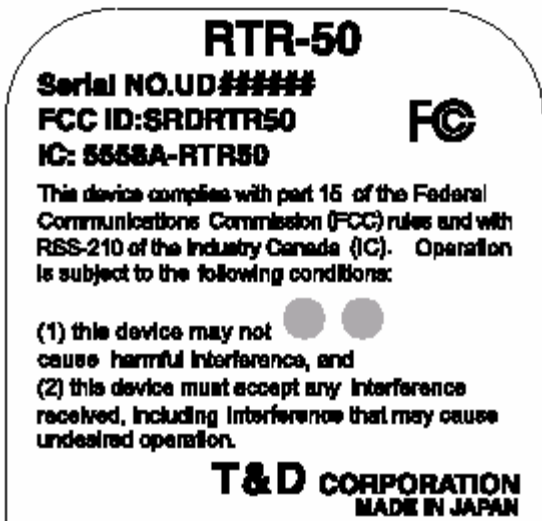
Figure A-1. FCC ID Label

Please see attachment for FCC ID label and label location.