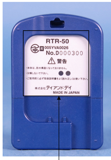
Figure A-3. FCC ID Label Location