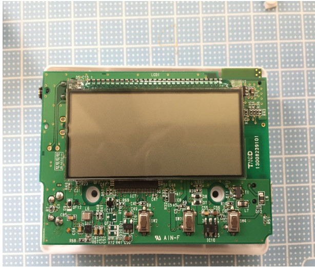
Board A side