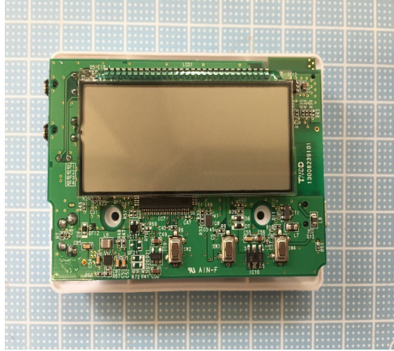
Board A side