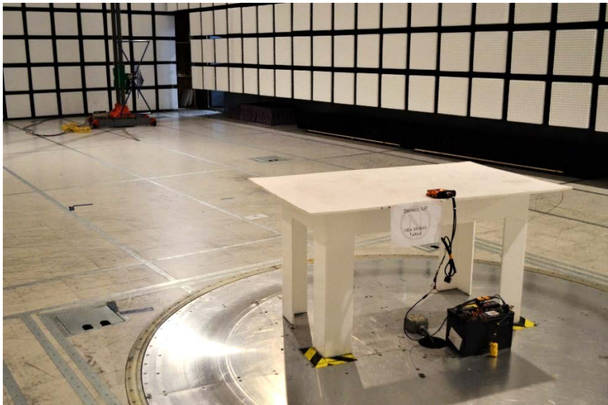
Figure 1.1-2: 30MHz-1GHz (Rear View)