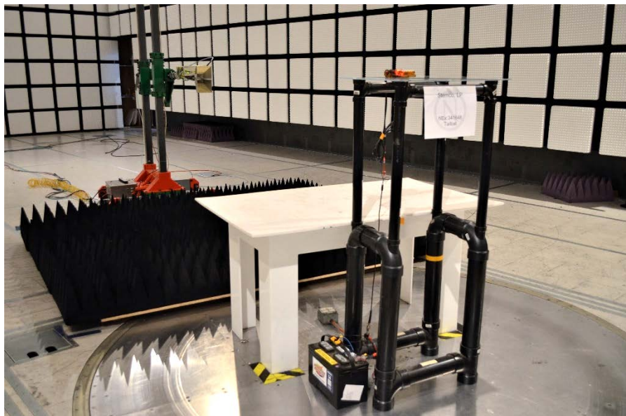
Figure 1.1-5: 1GHz-18GHz (Rear View)