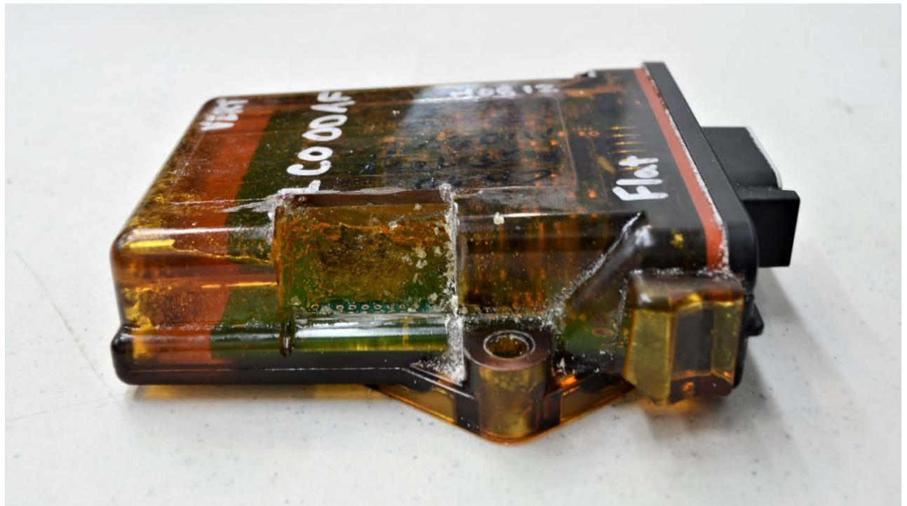
Figure 1.1-3: Side view photo