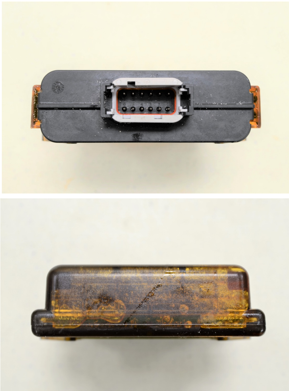
Figure 1.1-4: Top and Bottom view photo