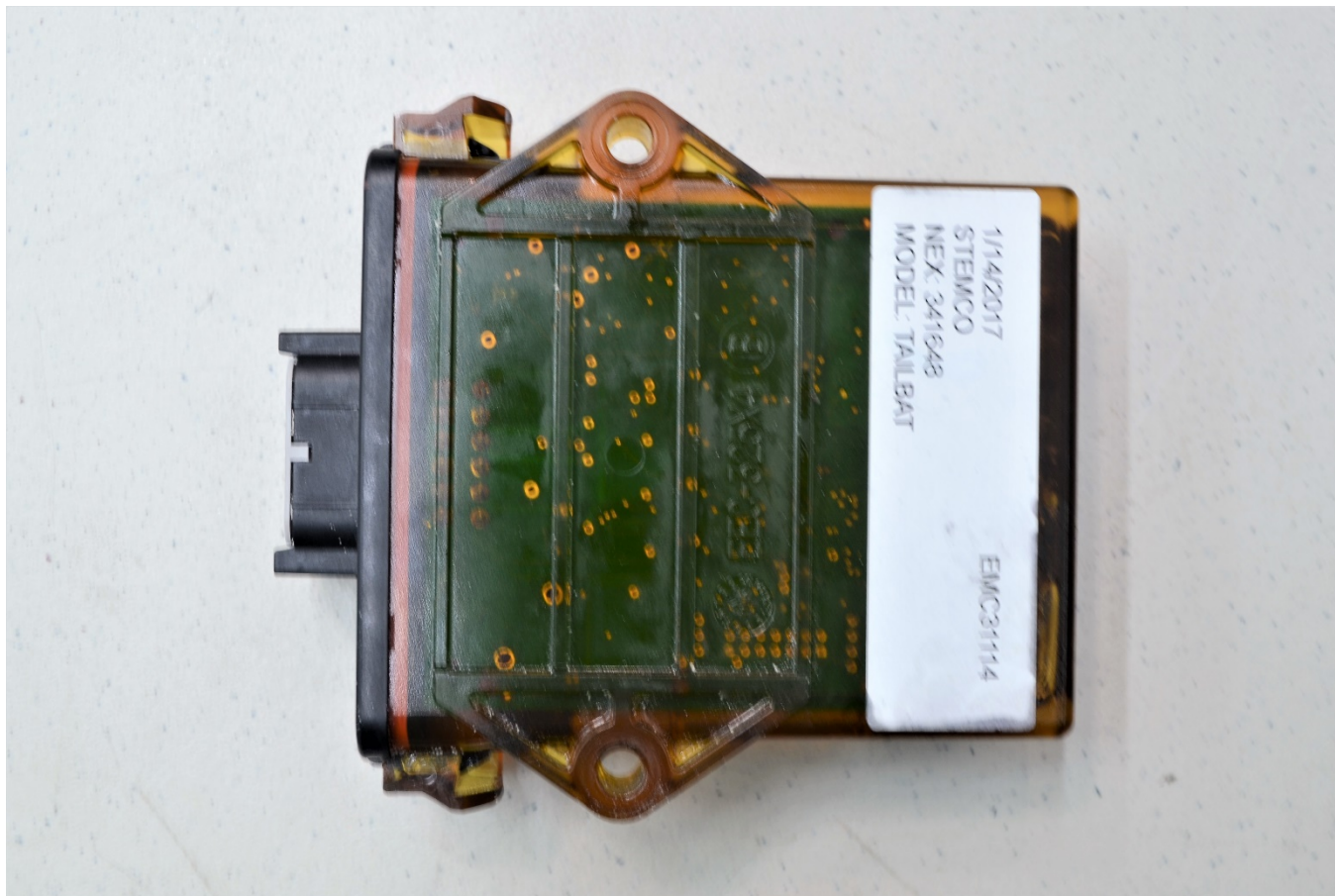
Figure 1.1-2: Rear view photo